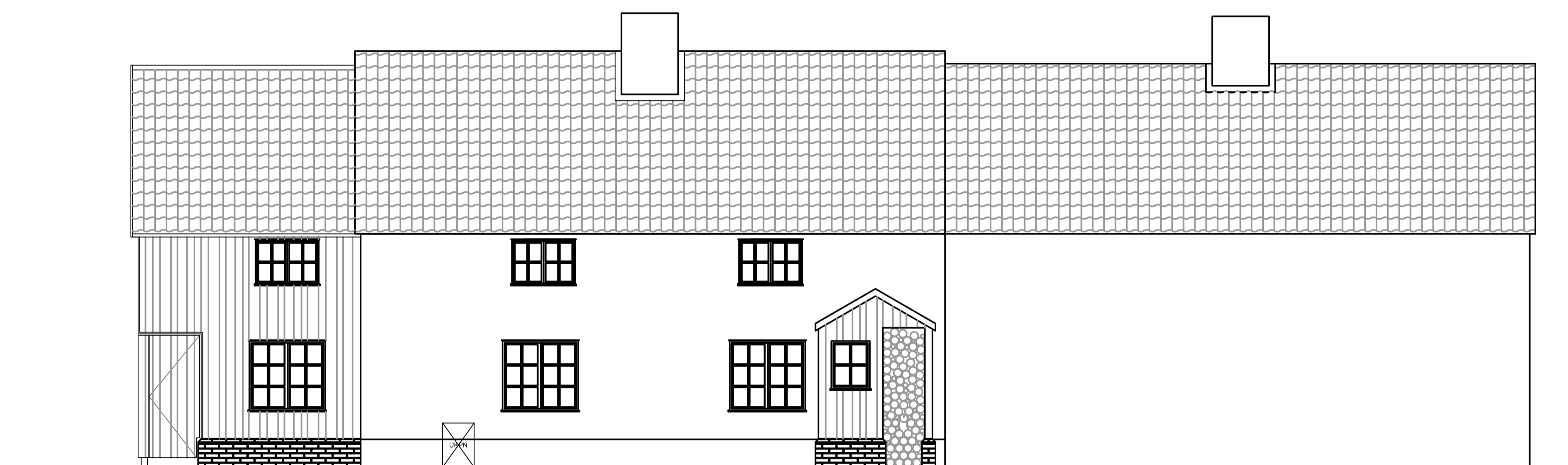
FRONT ELEVATION [EAST]