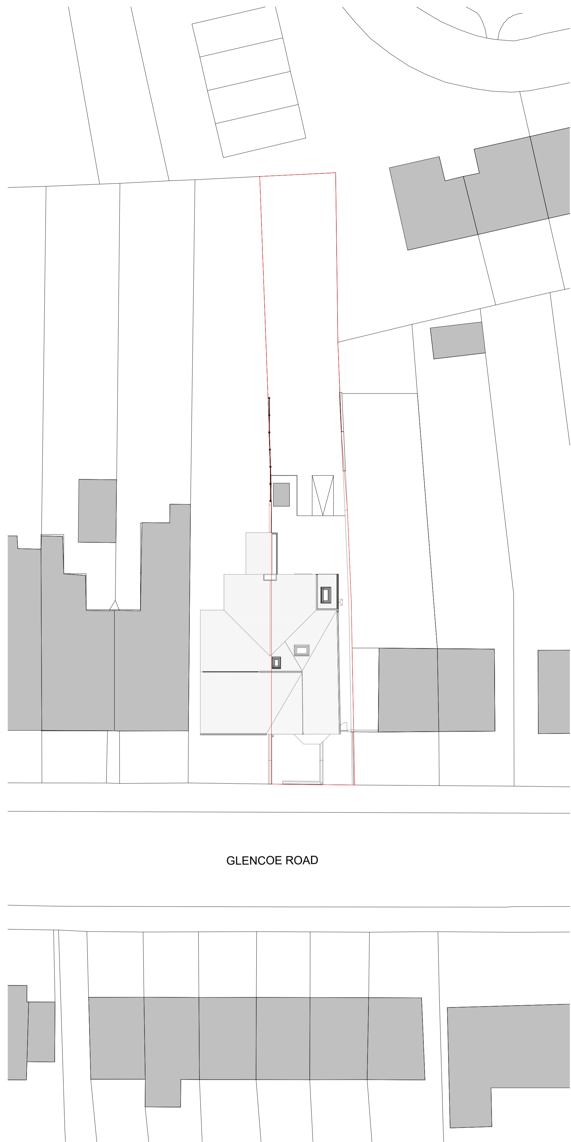
Site Plan 1 : 200