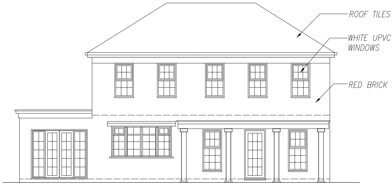
REAR ELEVATION SCALE 1:100@A3