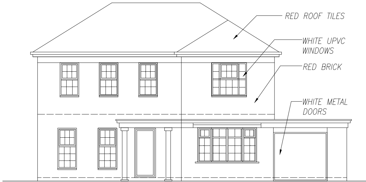
FRONT ELEVATION SCALE 1:100@A3