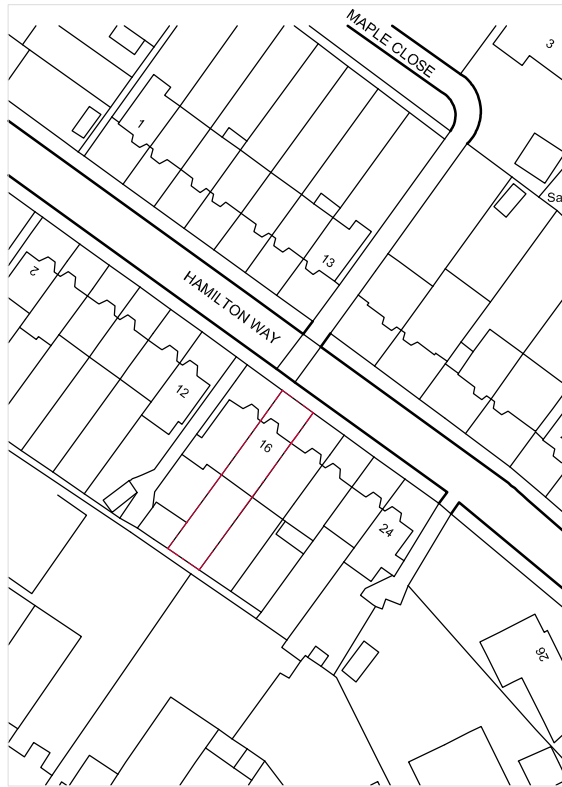
LOCATION PLAN 1:1 250