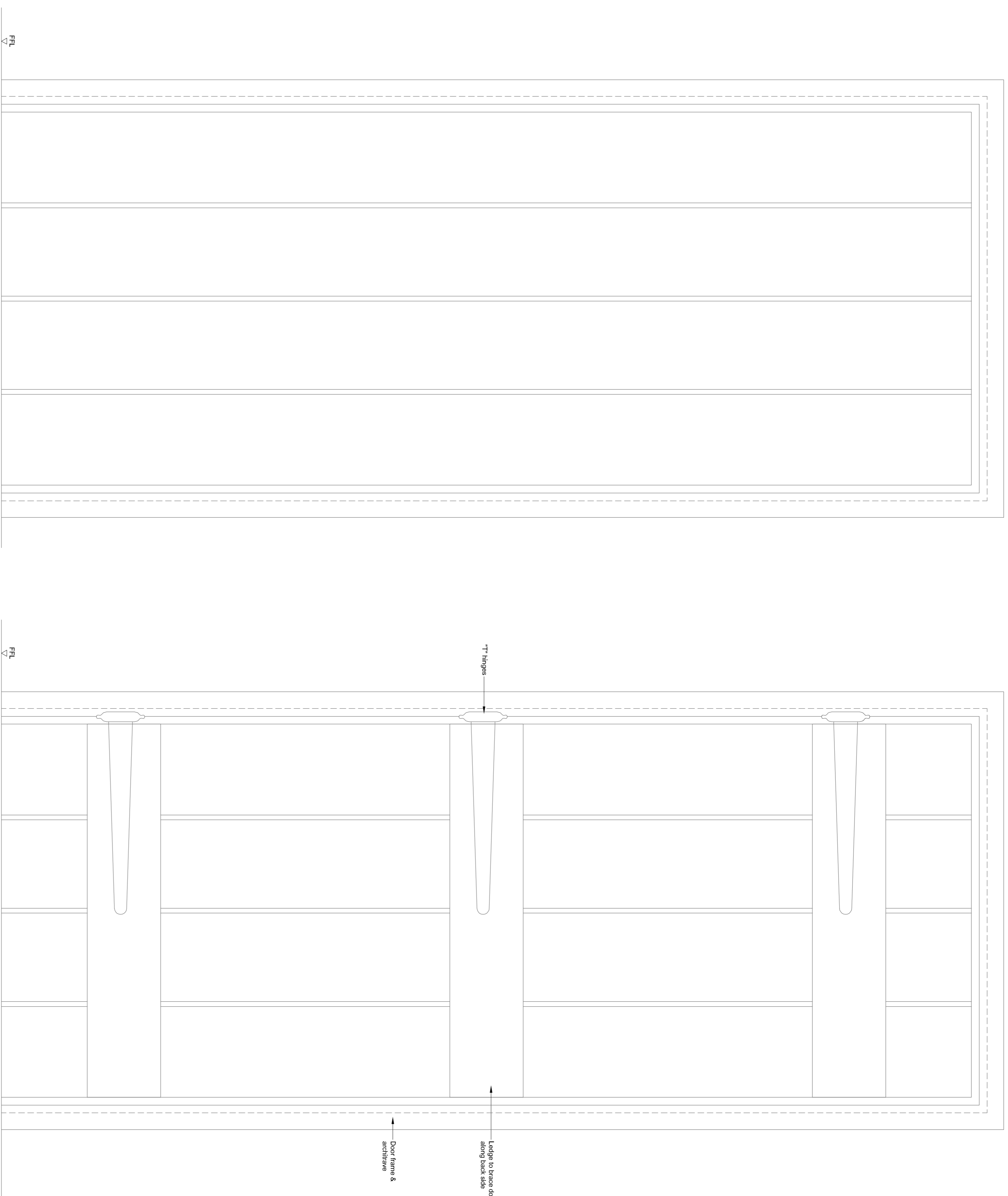
Detail 2a - Proposed Elevation Kitchen Door, Elevation (Condition 3c Listed Building Consent 2001188) Scale 1:3 @ A1