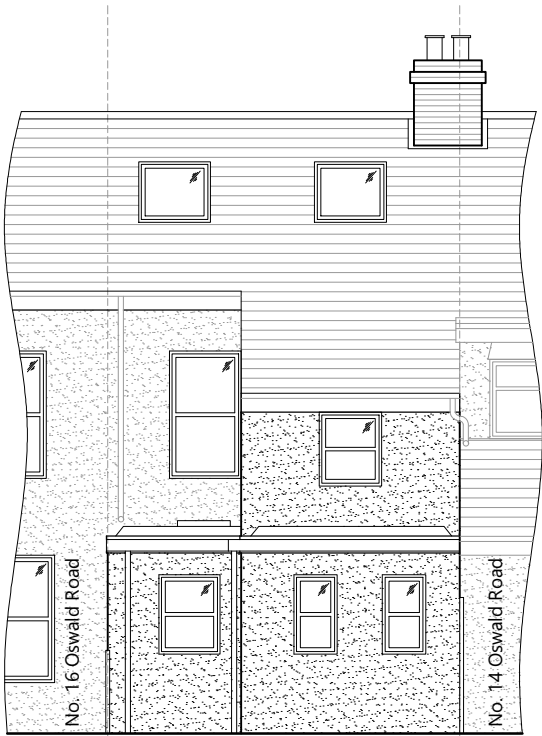
Proposed Rear Elevation Scale 1:100