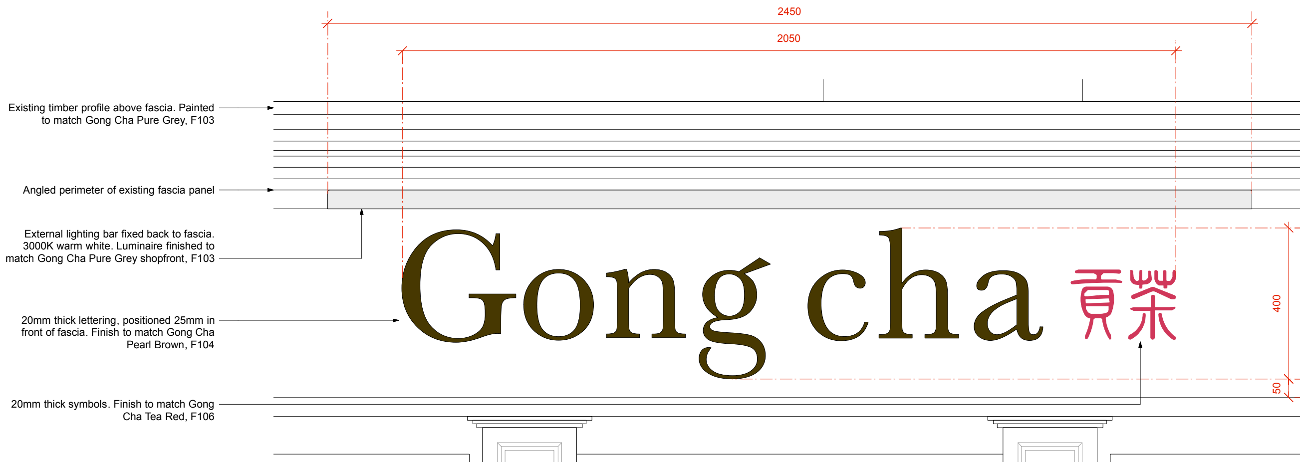
1 Main Sign Elevation Detail 400 Scale: 1:10