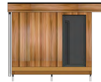
4 Left Elevation Scale: 1:100

Should there be any conflict between details and measurements on this or any other GartenHaus drawing, GartenHaus should be informed prior to construction on site. Until full approval of both planning and building regulations have been granted all drawings are preliminary and are not for construction. If any work commences prior to approval being granted it is entirely at his/her own risk. This Drawing is Subject to Copyright ©. All drawings remain the copyright of GartenHaus Ltd and may not be copied or reproduced without written consent of GartenHaus Ltd.