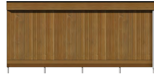
2 Rear Elevation Scale: 1:100