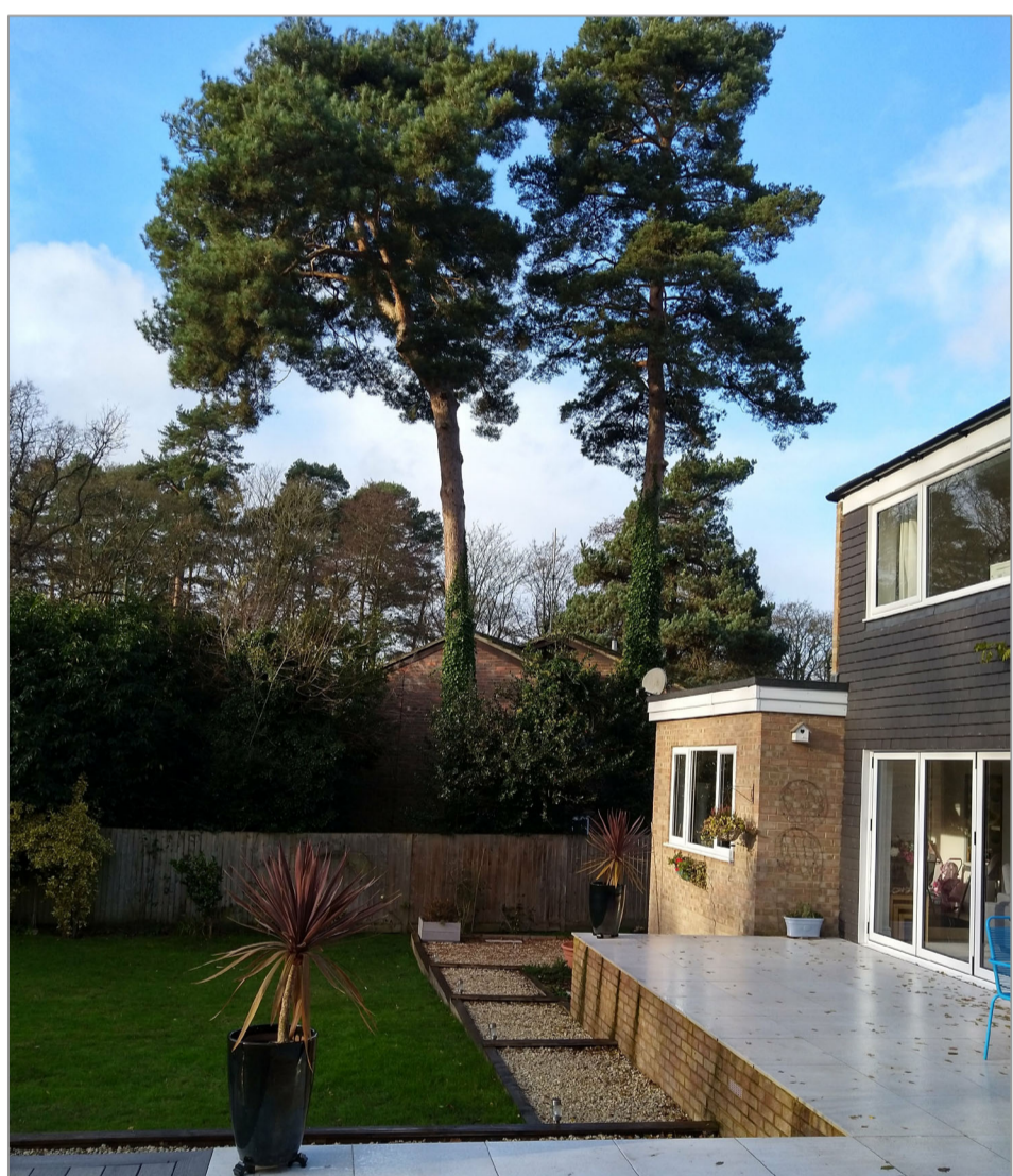
PHOTOGRAPH OF REAR ELEVATION AND TREE 01 AND TREE 02