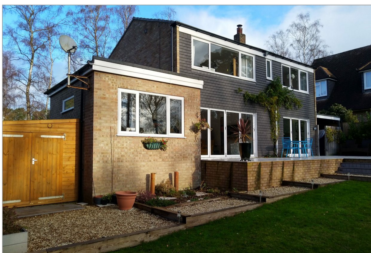
PHOTOGRAPH OF REAR ELEVATION AND EXISTING RAISED PATIO