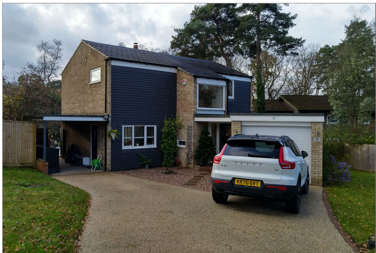
PHOTOGRAPH OF FRONT ELEVATION