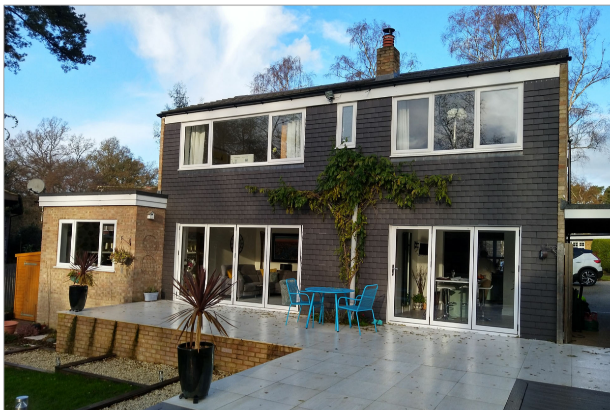
PHOTOGRAPH OF REAR ELEVATION