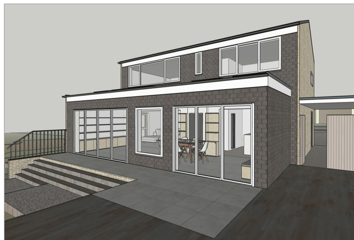
3D RENDER SHOWING PROPOSED REAR EXTENSION