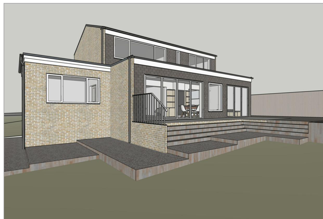
3D RENDER SHOWING PROPOSED REAR EXTENSION