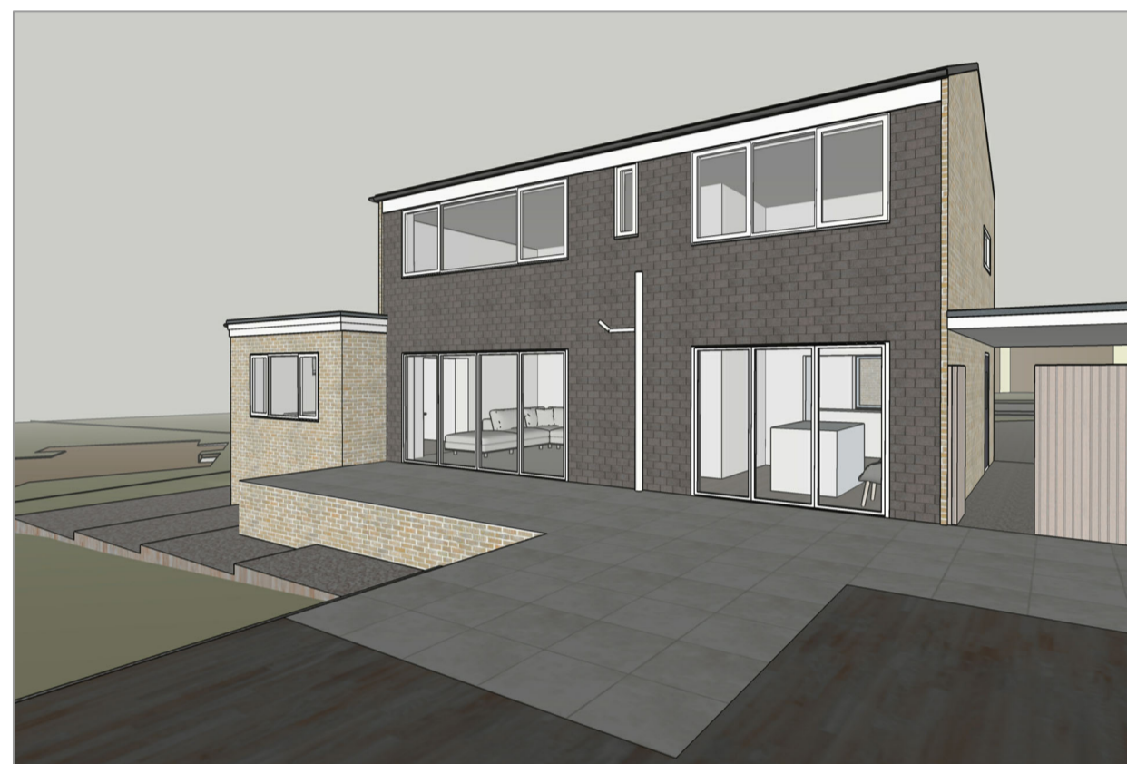
3D RENDER SHOWING EXISTING REAR ELEVATION