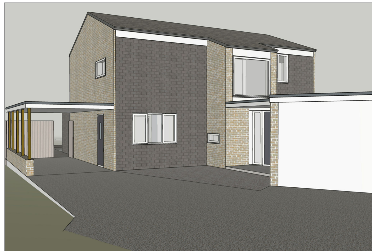
3D RENDER OF PROPOSED EXTENSION FROM FRONT ELEVATION