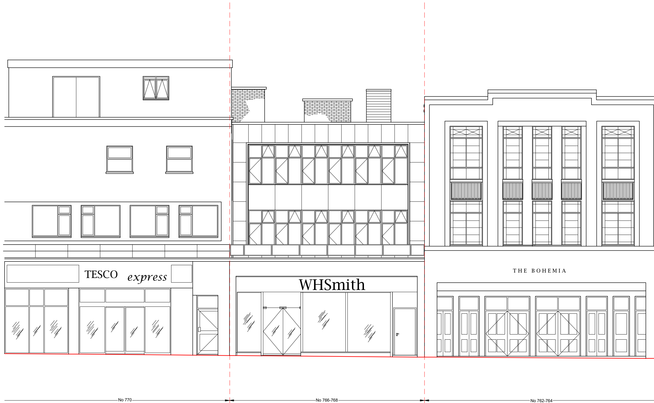
① Existing Front/West Elevation 1 : 100