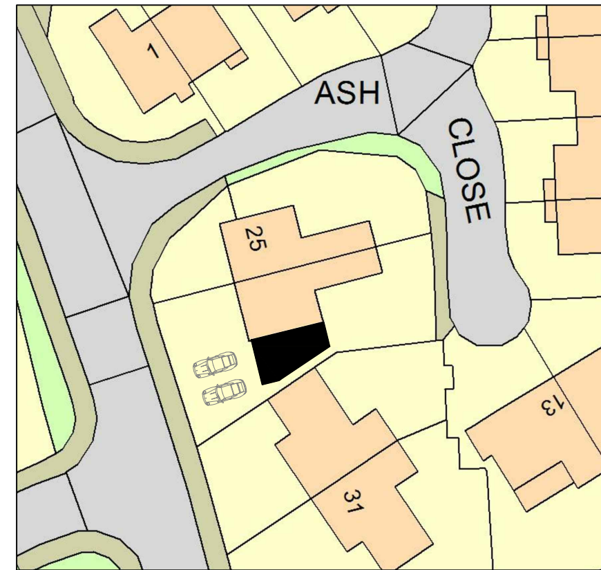
Proposed Block plan 1:500