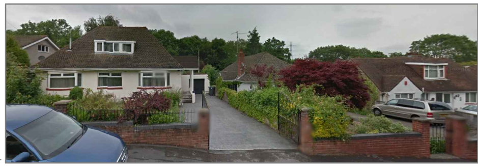
7 MELVILLE AVENUE

SPECIFICATIONS: ROOF: Roof tiles to match existing house. WALLS: Cavity walls with rendered/painted finish to match house. WINDOWS AND DOORS: White upvc doubled glazed to match existing house.