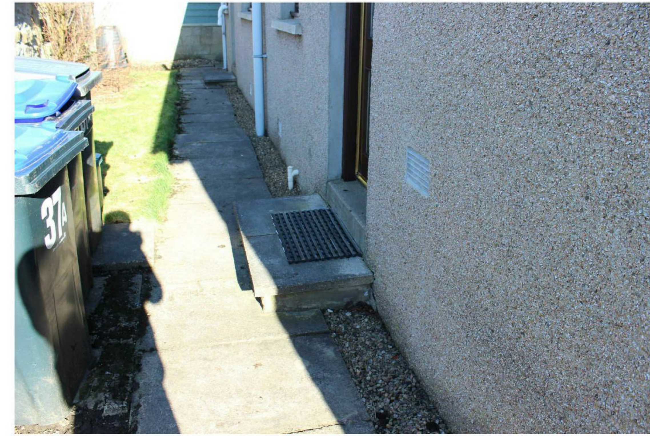
EAST ELEVATION FROM DRIVEWAY: Rear Step into Kitchen.