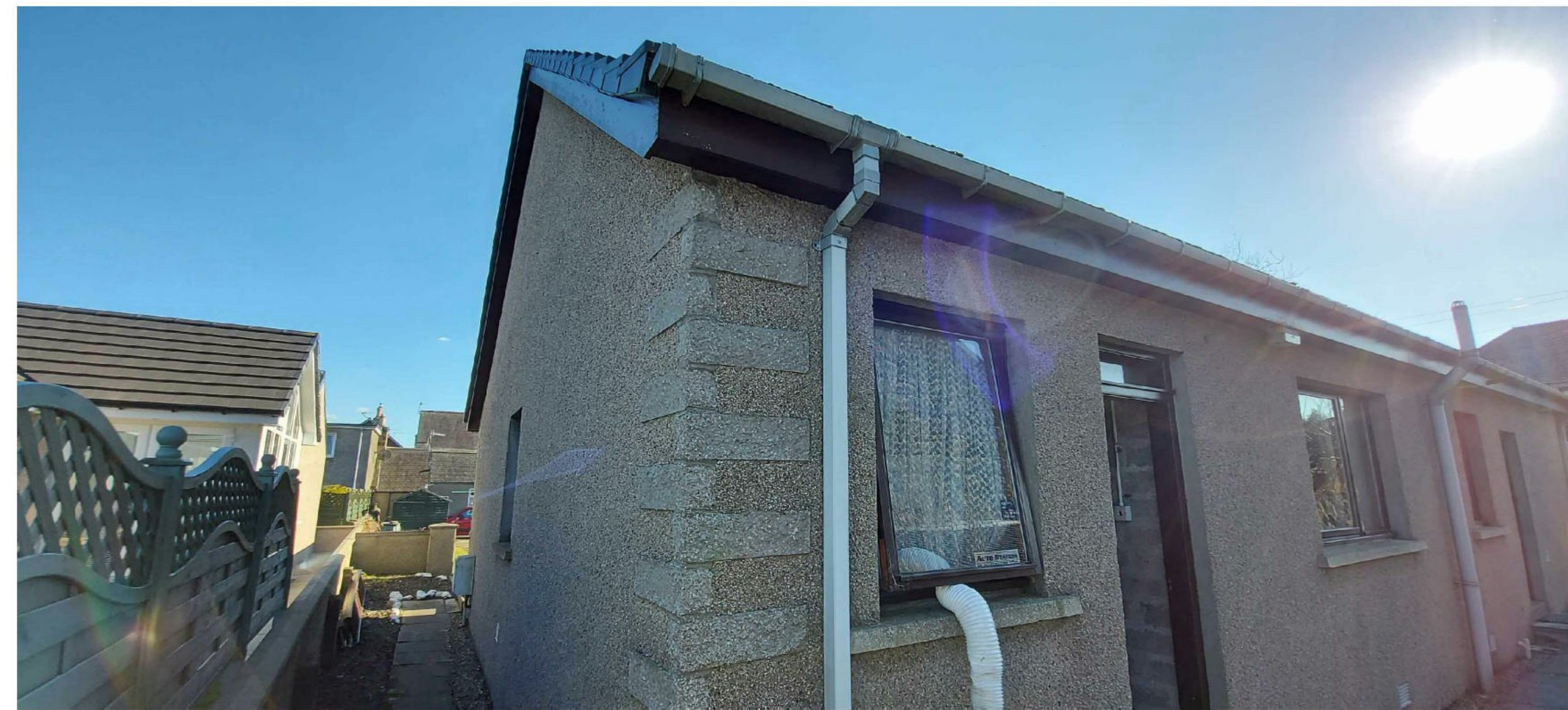
NORTH & WEST ELEVATION FROM GARDEN: Garage Window No's 1 & 2, Garage Door, Bedroom Window, Bathroom Window & Kitchen Rear Entrance Door.