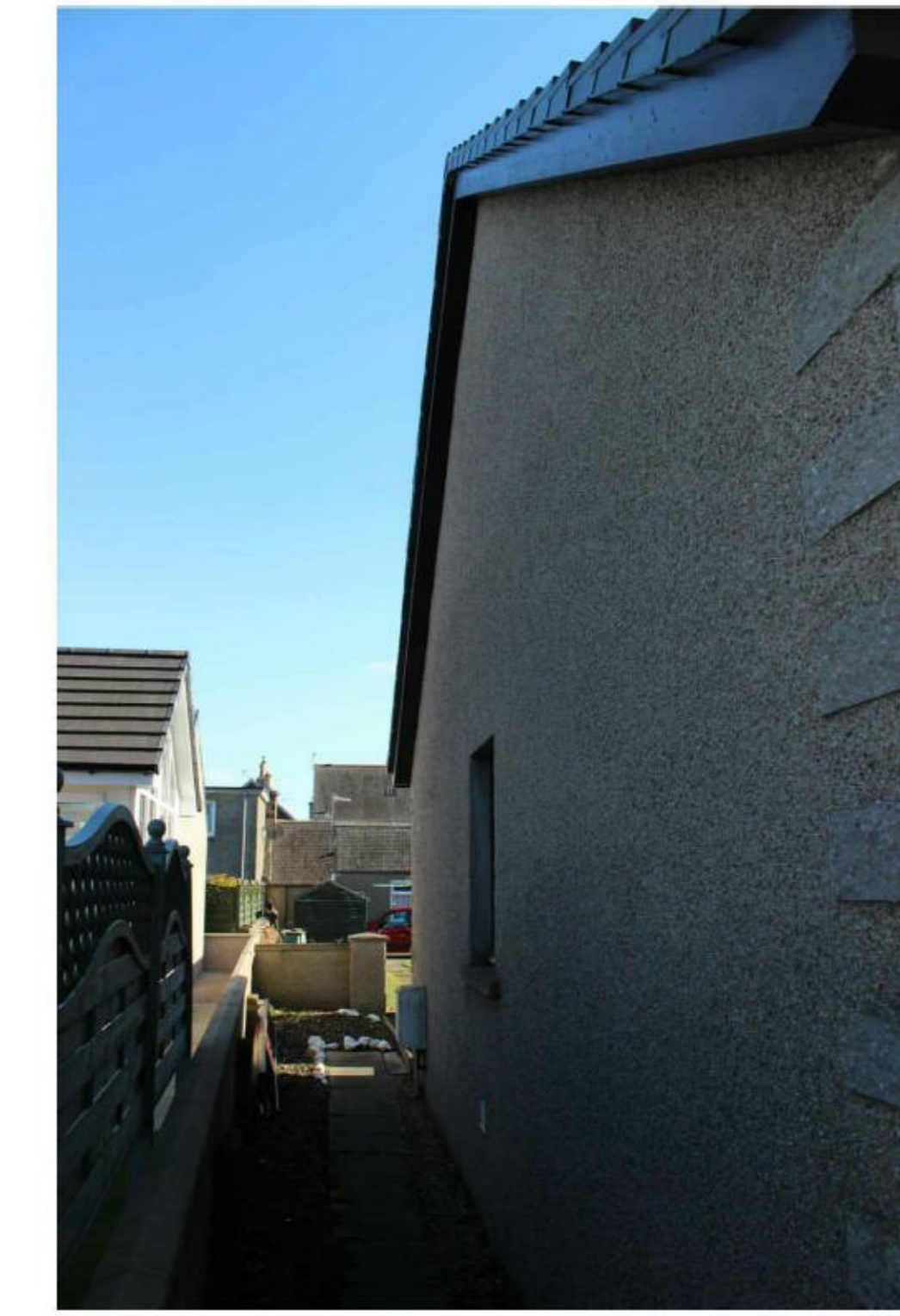
NORTH ELEVATION FROM GARDEN: Garage Window No.2