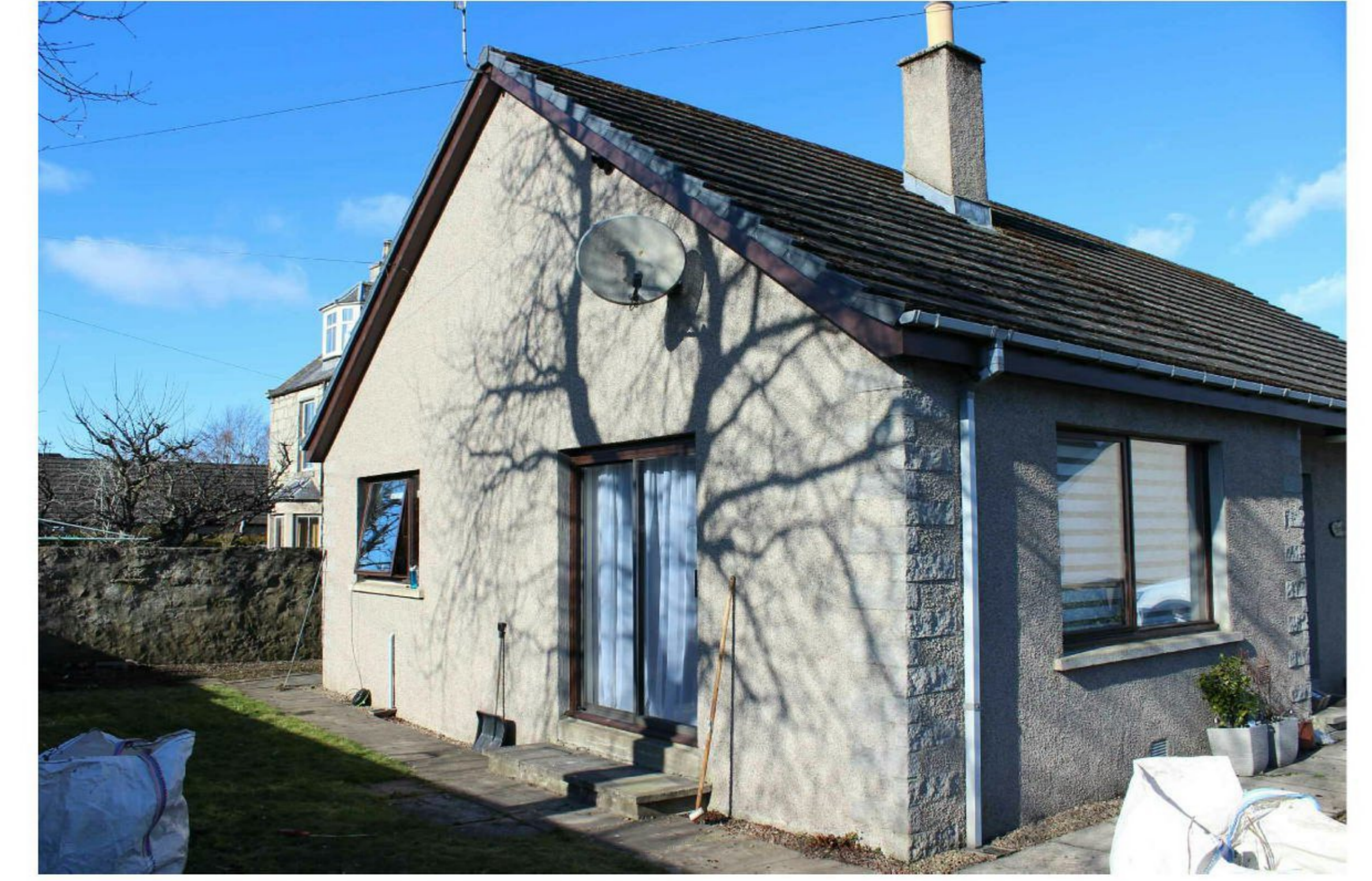
SOUTH ELEVATION FROM GARDEN: Lounge Window, Lounge Sliding Door & Kitchen Window.