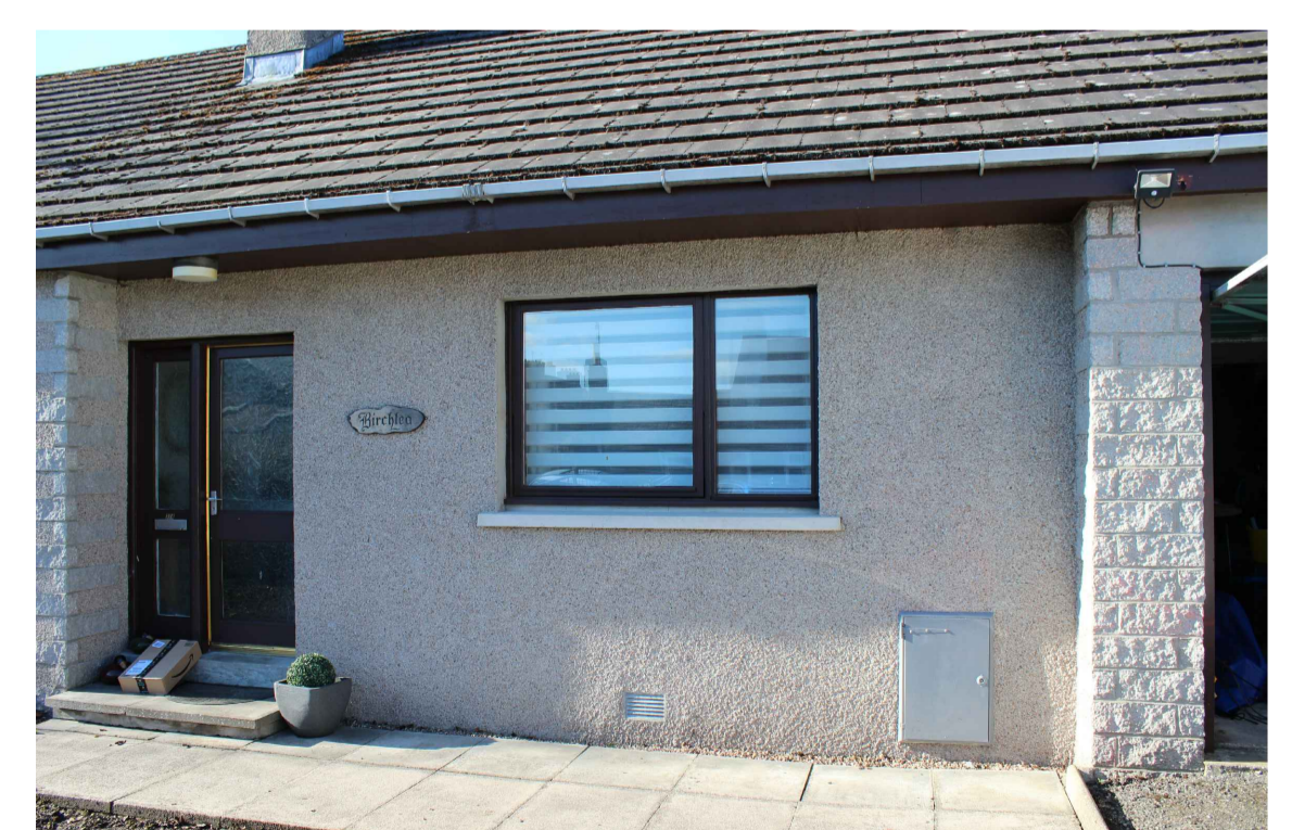
EAST ELEVATION FROM GARDEN WALL: Front Entrance Door & Bedroom Window.