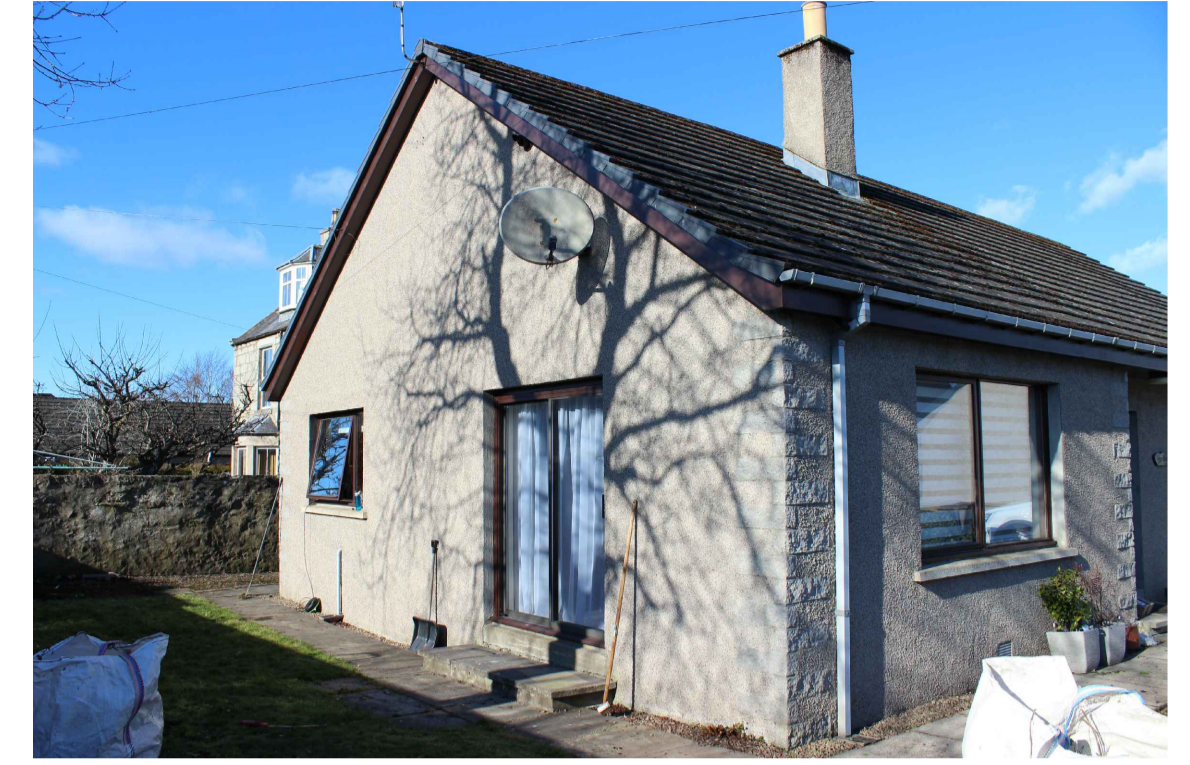
SOUTH ELEVATION FROM GARDEN: Lounge Window, Lounge Sliding Door & Kitchen Window.