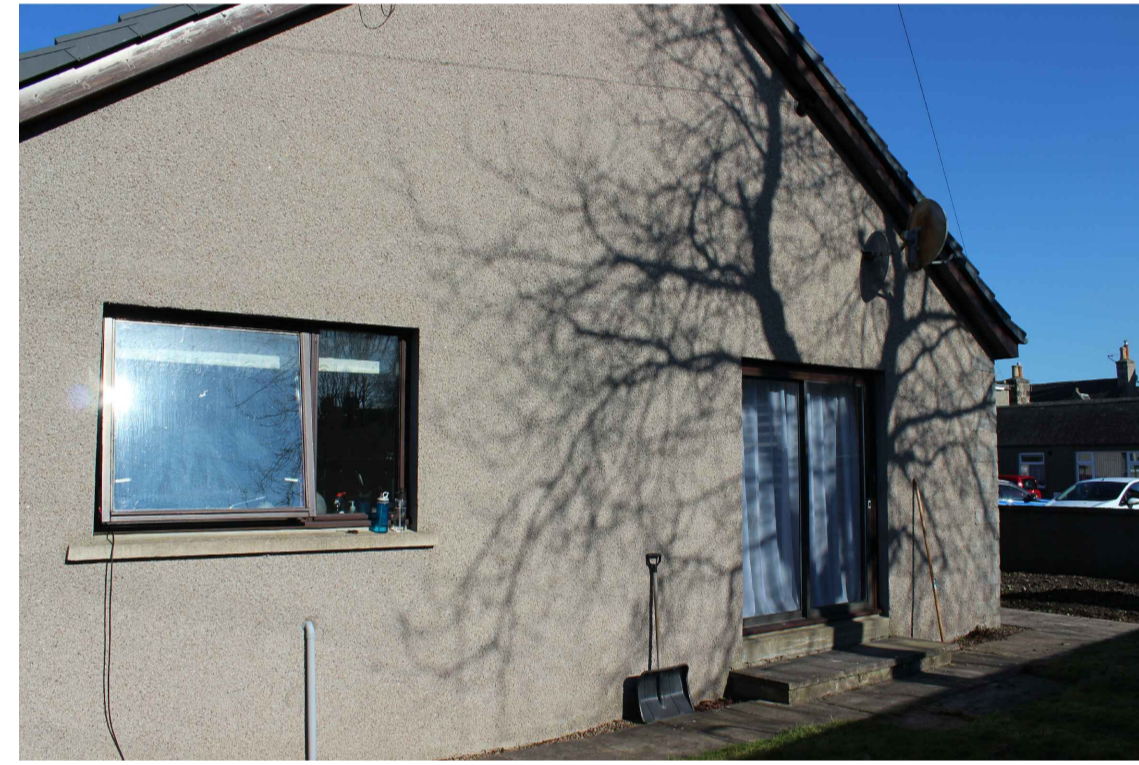
SOUTH ELEVATION FROM GARDEN: Kitchen Window & Lounge Sliding Door.