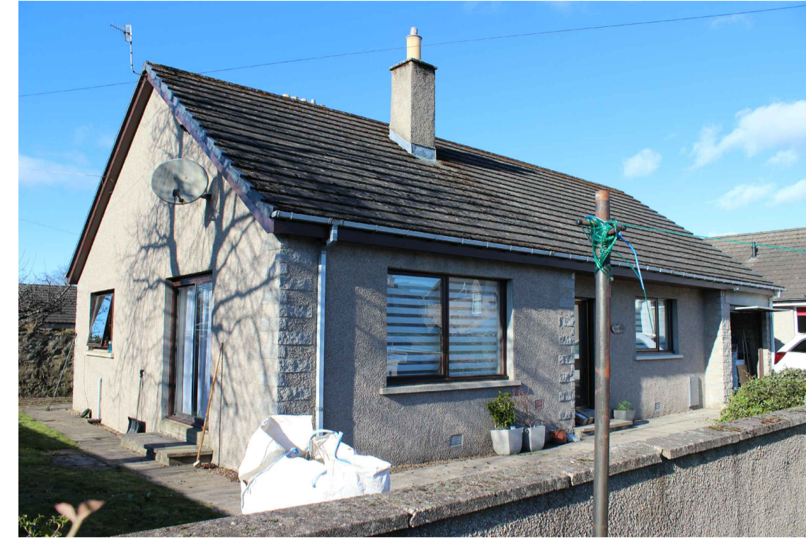
SOUTH EAST CORNER FROM GARDEN WALL: Lounge Window, Bedroom Window, Lounge Sliding Door & Kitchen Window.