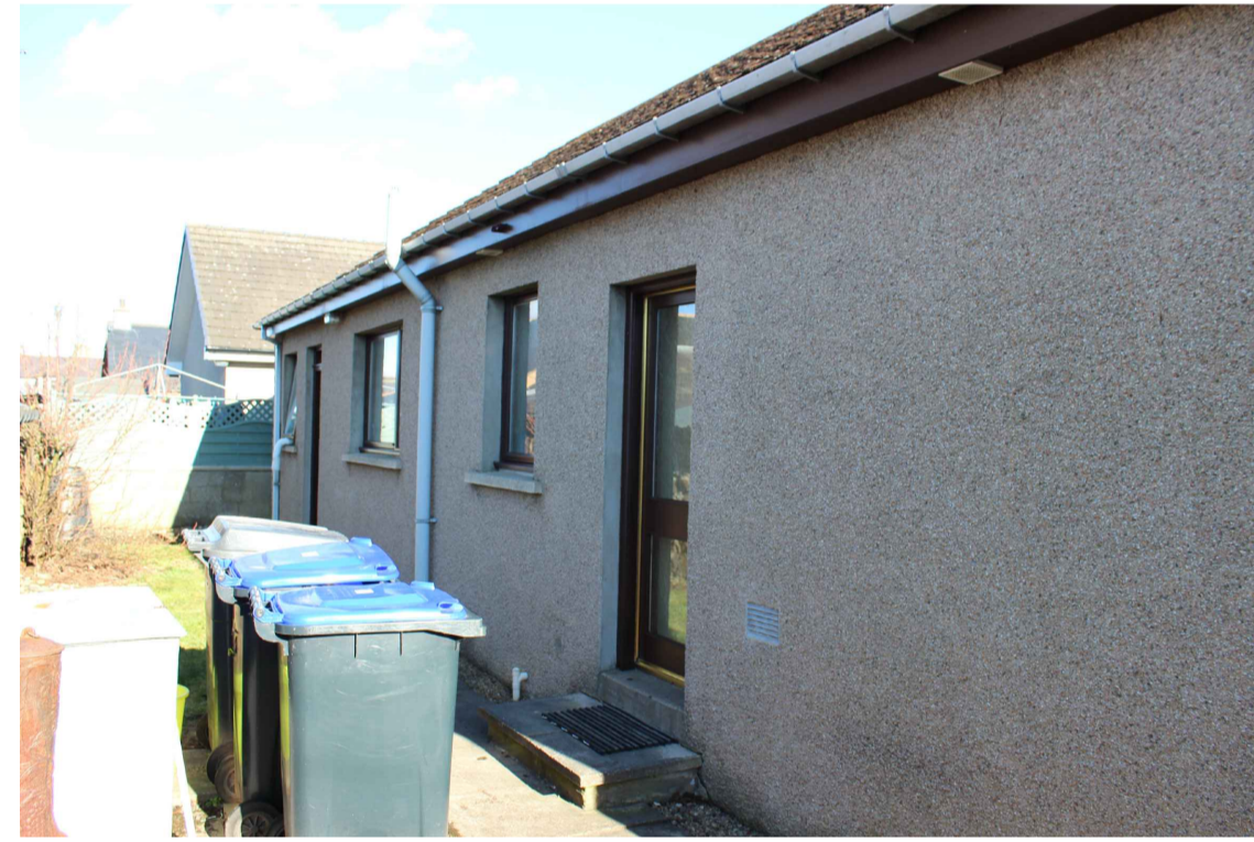
WEST ELEVATION FROM GARDEN: Garage Window No.1 & Door, Bedroom Window, Bathroom Window & Kitchen Rear Entrance Door.