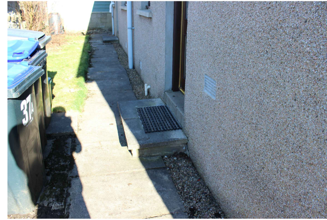
EAST ELEVATION FROM DRIVEWAY: Rear Step into Kitchen.