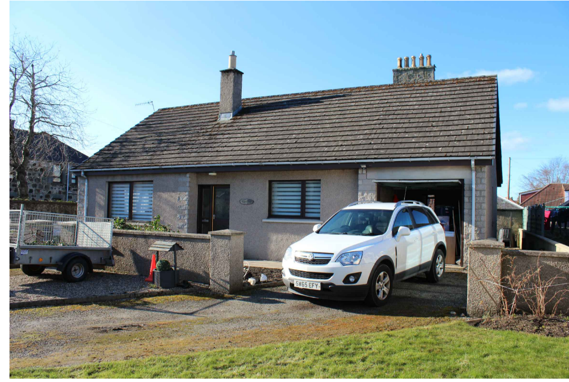
EAST ELEVATION FROM DRIVEWAY: Front Entrance Door, Lounge Window & Bedroom Window.