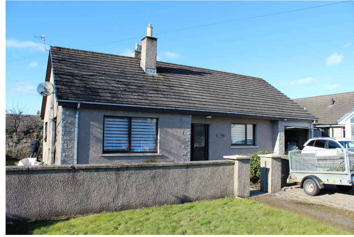
EAST ELEVATION FROM DRIVEWAY: Lounge Window & Bedroom Window.