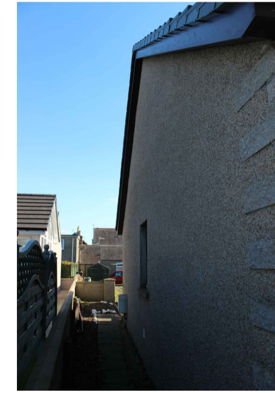
NORTH ELEVATION FROM GARDEN: Garage Window No.2