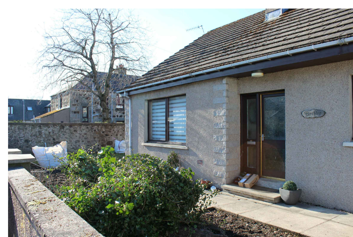
EAST ELEVATION FROM GARDEN WALL: Lounge Window & Front Entrance Door.