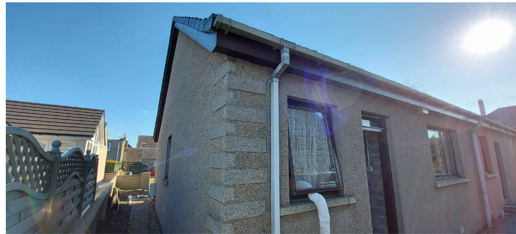
NORTH & WEST ELEVATION FROM GARDEN: Garage Window No's 1 & 2, Garage Door, Bedroom Window, Bathroom Window & Kitchen Rear Entrance Door.