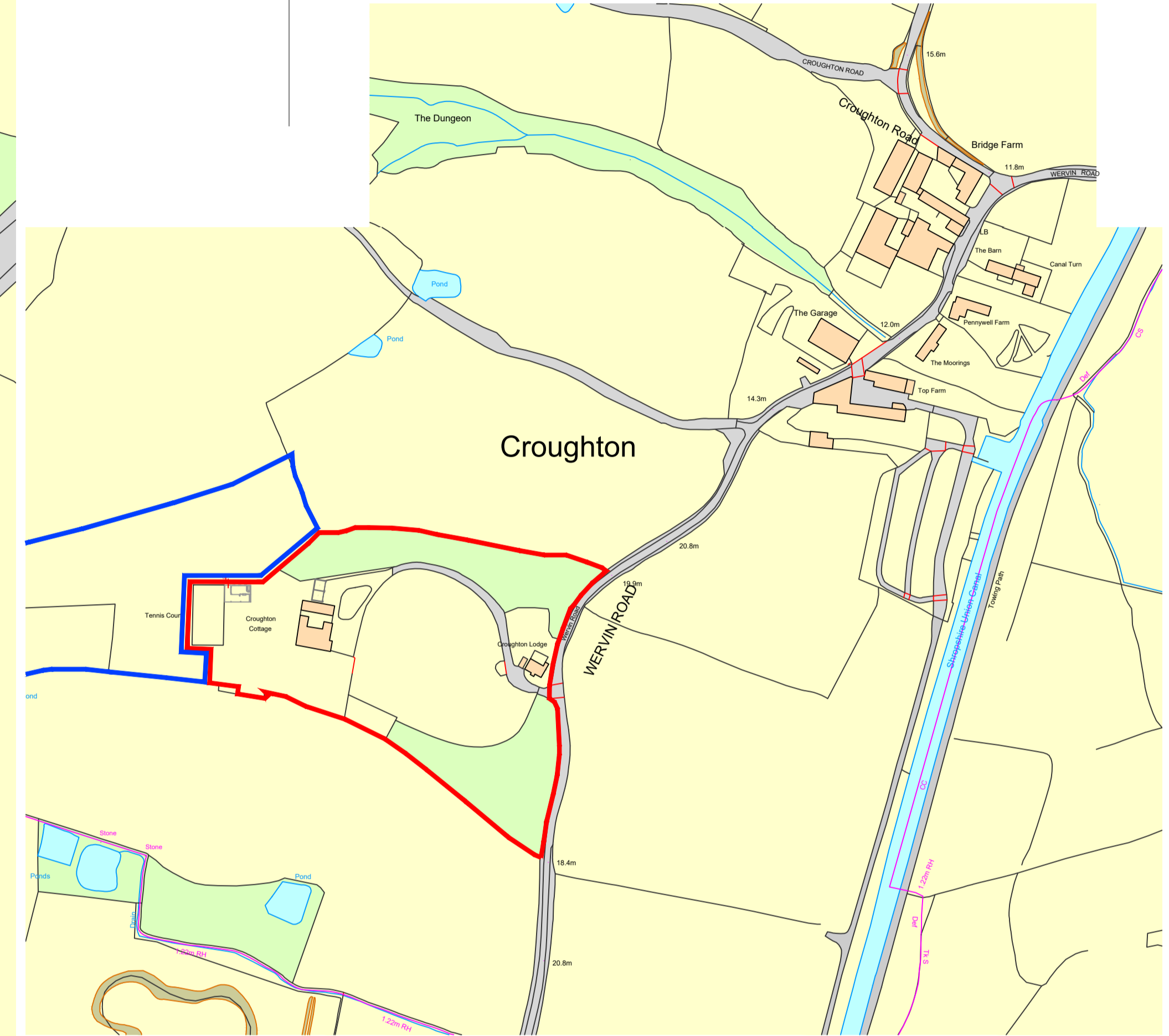
LOCATION PLAN 1 : 2 500

■ pemnon house 76, hoole road, hoole, chester CH2 6NL ■ www.willacyhorsewood.co.uk Tel: 01244 853891 07973 322 953 E-Mail: mark@willacyhorsewood.co.uk