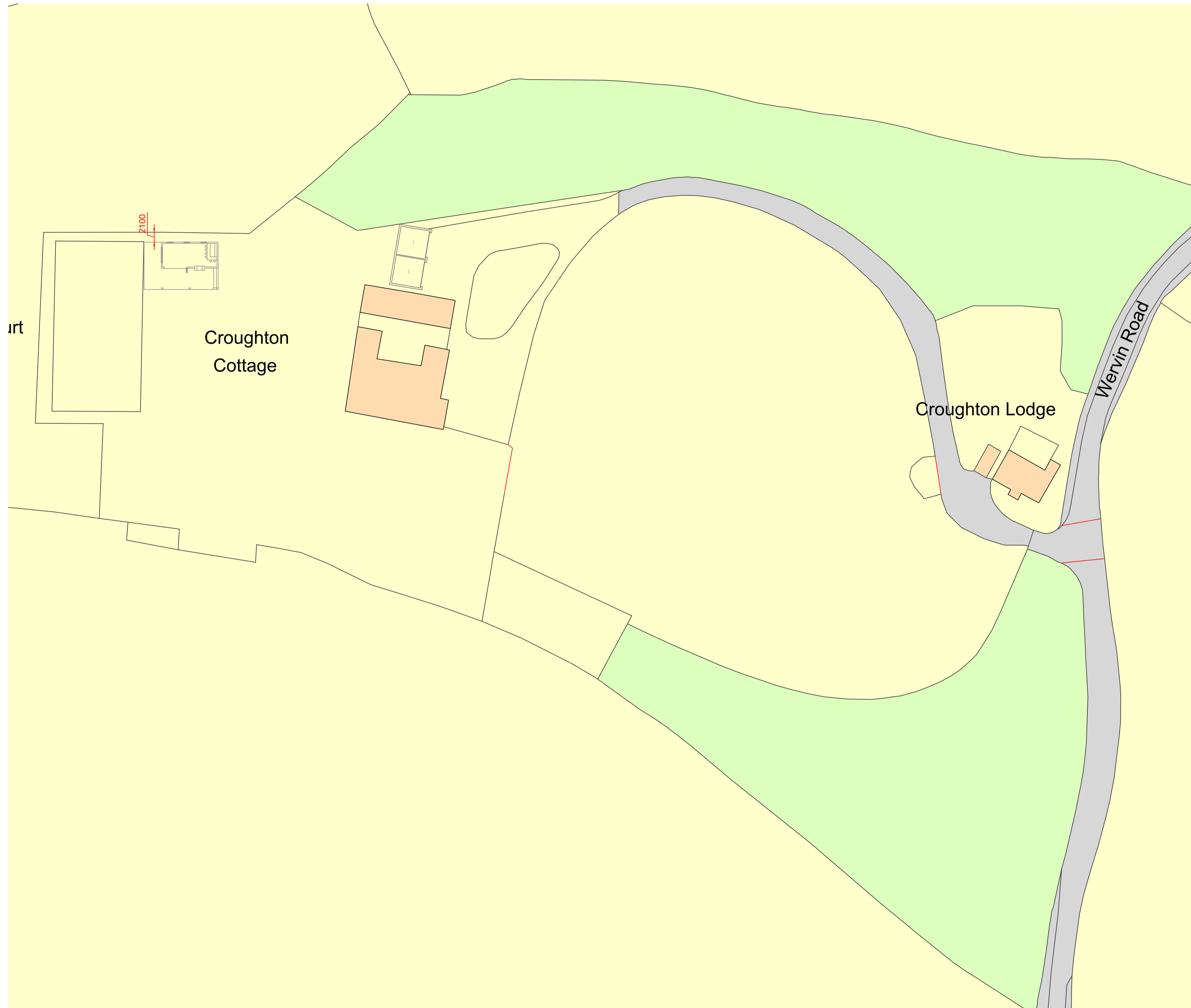
BLOCK PLAN 1 : 500

The content of this drawing is subject to the provision of the Copyright Act 1956. Work to figured dimensions only. Site dimensions are to be checked before work is started. Any discrepancy whatsoever between any information contained on this drawing and any other document or drawing must be drawn to the attention of the Architect by the contractor before the work is executed. IF IN DOUBT ASK IMMEDIATELY.