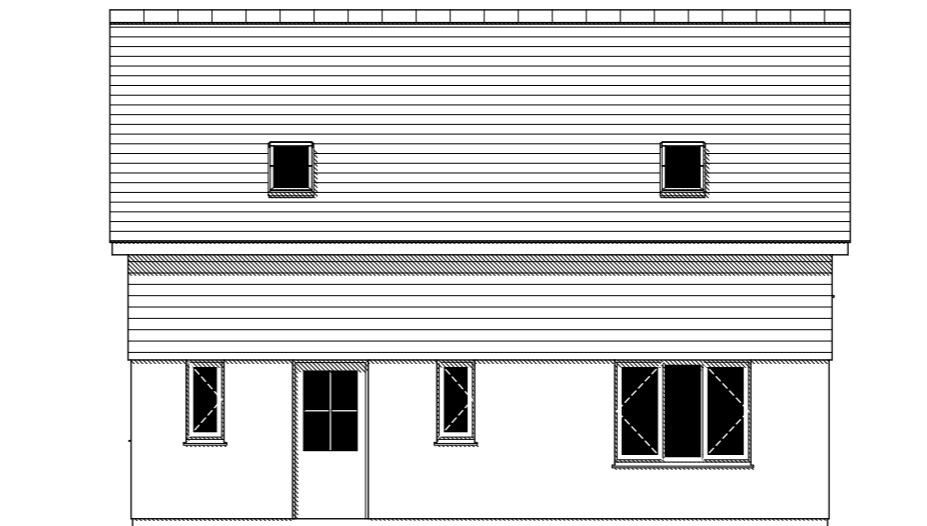
H6 NORTH ELEVATION 1:100