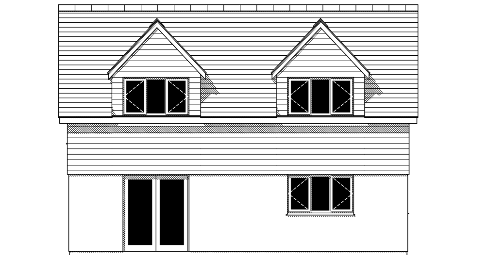
H6 SOUTH ELEVATION 1:100