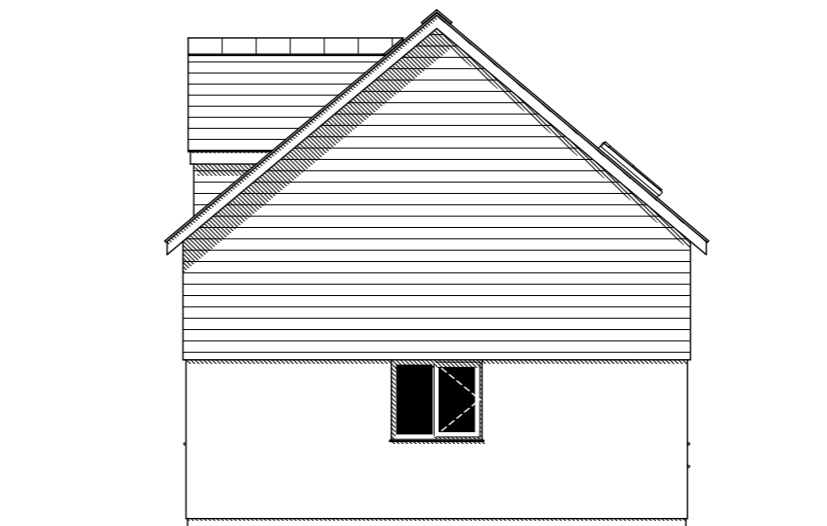
H6 EAST ELEVATION 1:100