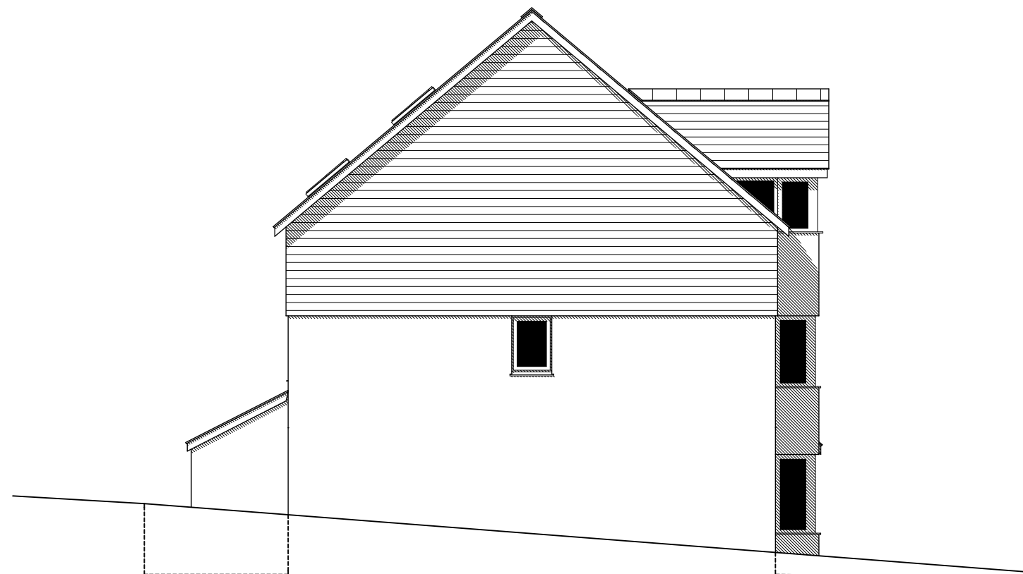
H3_4 EAST ELEVATION 1:100