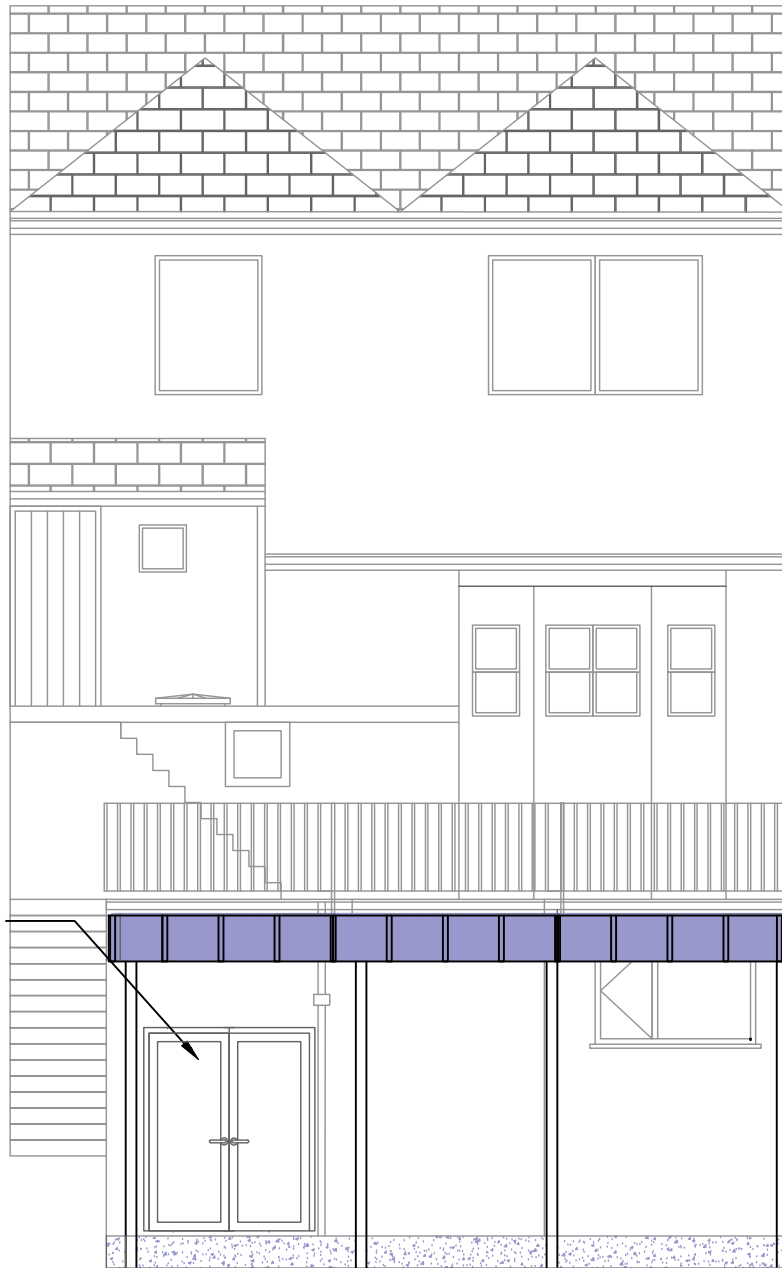
West Elevation (Existing)

New timber double glazed door as described within Appendix C