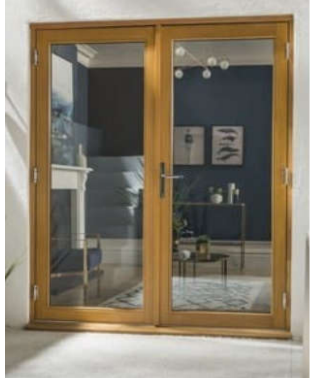
Existing Patio doors leading to lounge area (facing west) - Proposed double glazed Patio doors