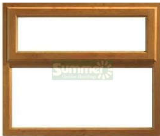
Proposed replacement window (south facing northern extension) Proposed windows to be casement hardwood timber style with golden oak finish.