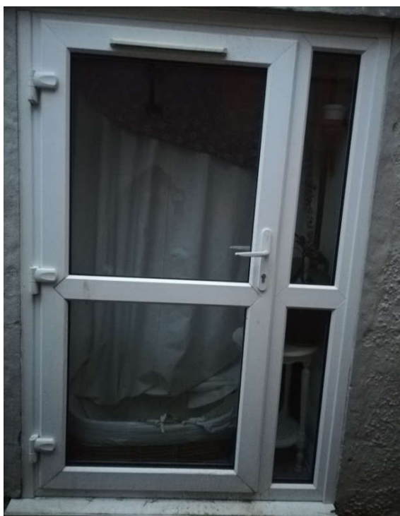
Existing door leading to northern extension (bedroom)