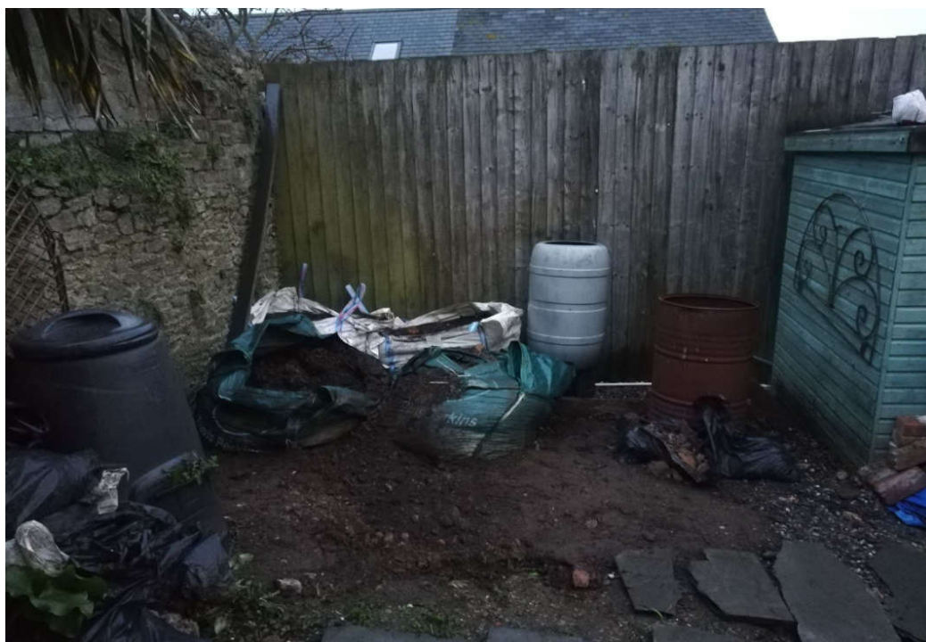
Proposed shed location