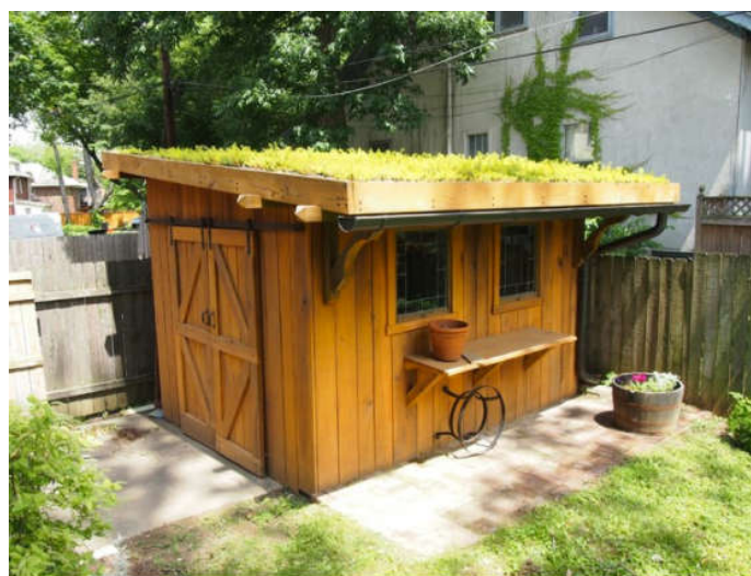
Proposed shed with green roof (to sit next to existing)