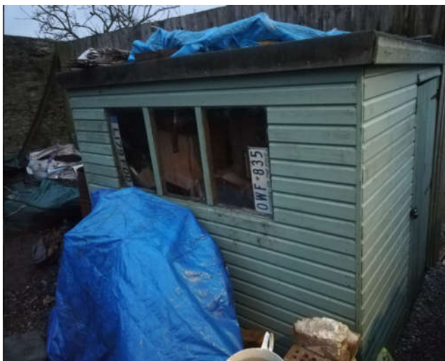
Existing shed (to remain in place)