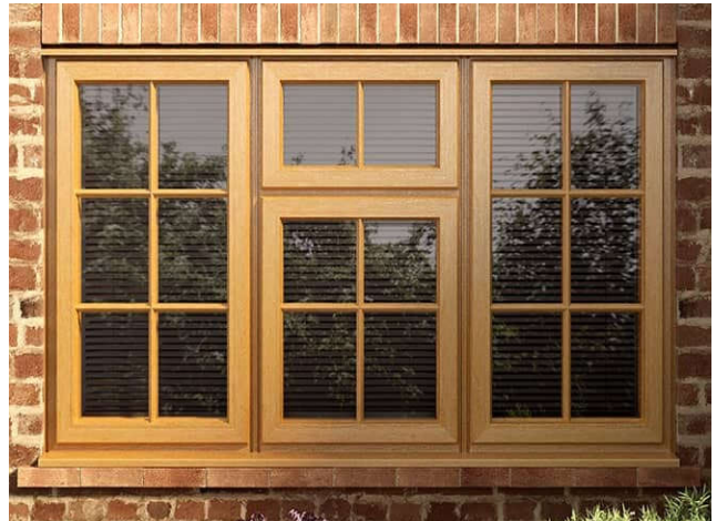
Existing windows (east facing southern extension) Proposed windows east facing southern extension

Left and right window on west tenement to open out with hinges on each edge closest to their respective walls. Central top window to open outwards with hinges at the top. Central bottom window is fixed.