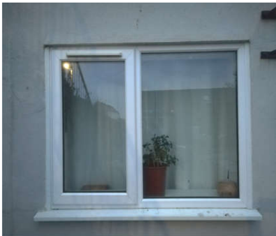
Existing window (west facing northern extension) to be replaced with double glazed patio doors, to improve light quality within room and access to lobby