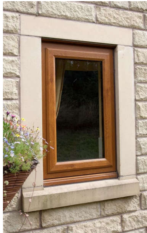
Existing courtyard window (south facing northern extension) - Proposed courtyard window