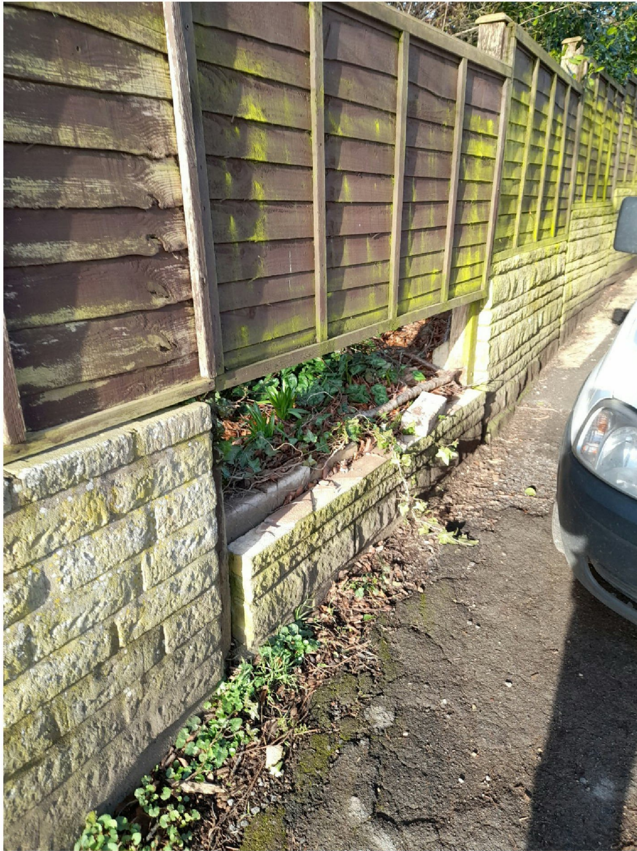
Section of wall displaced by roots and falling outwards, dismantled to protect pedestrians. Also visible, displacement of footway.