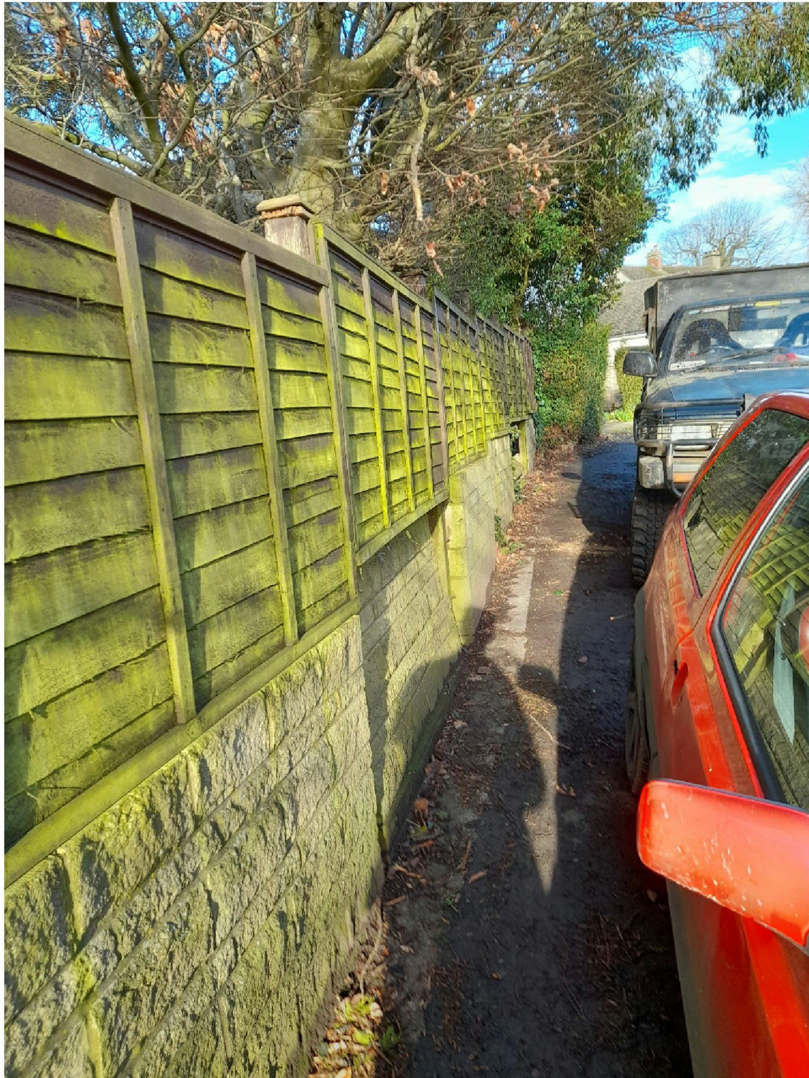
View of fencing/wall along Pullens Road showing the displacement by tree roots.