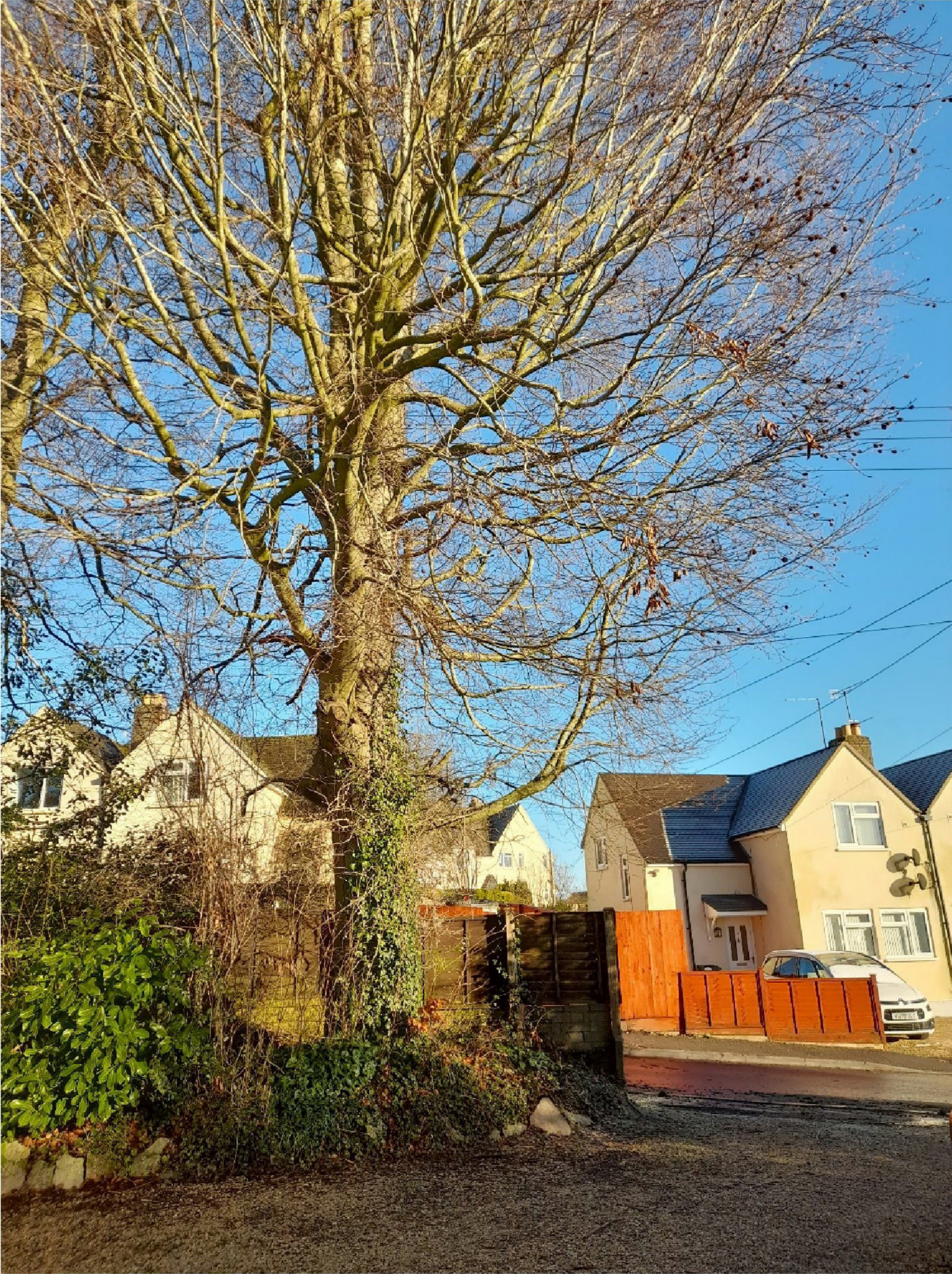
Beech tree 1 – raised position, branches passing through power lines