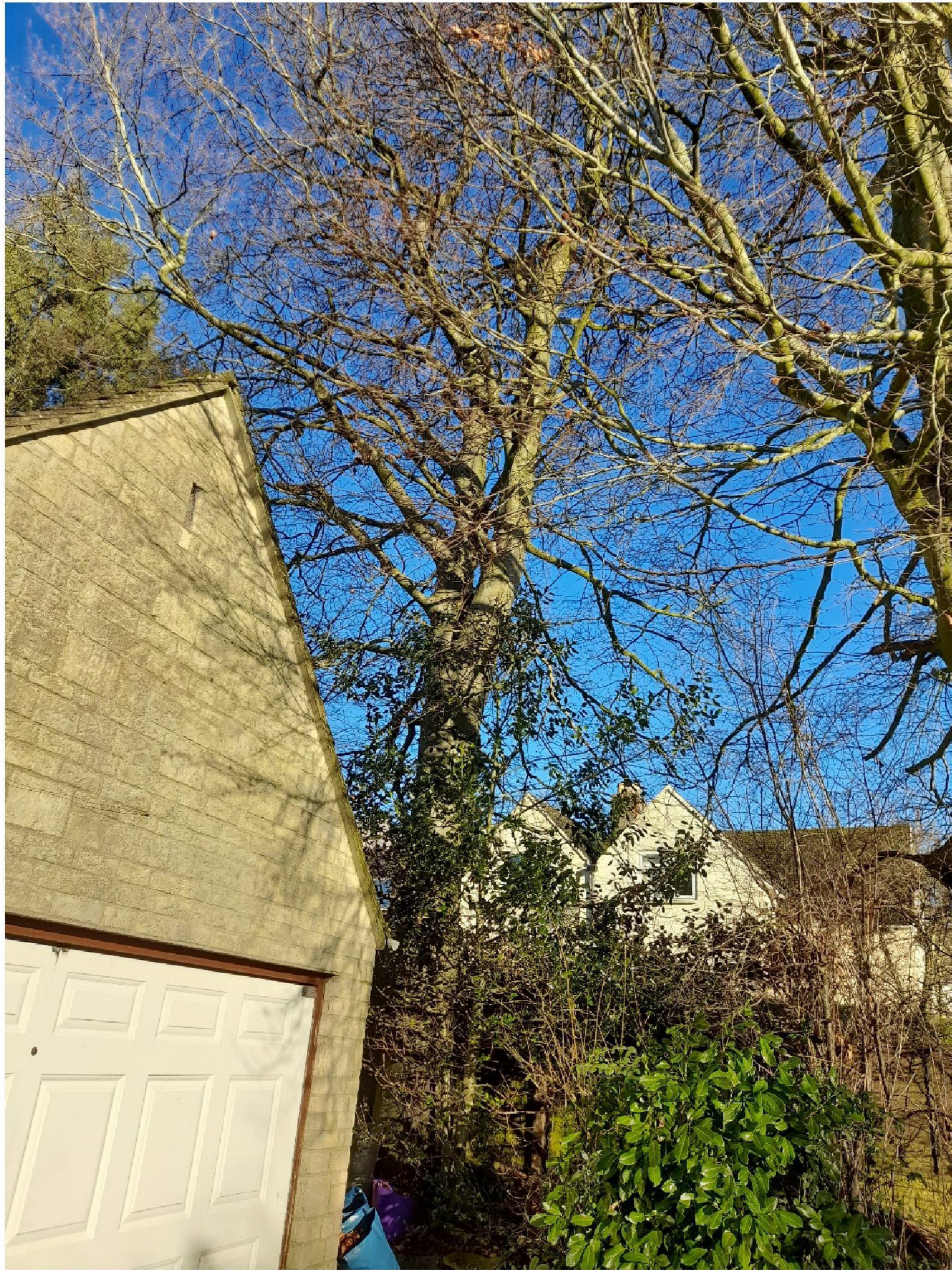
Beech tree 2 – raised position, next to garage. Branches passing through power lines.