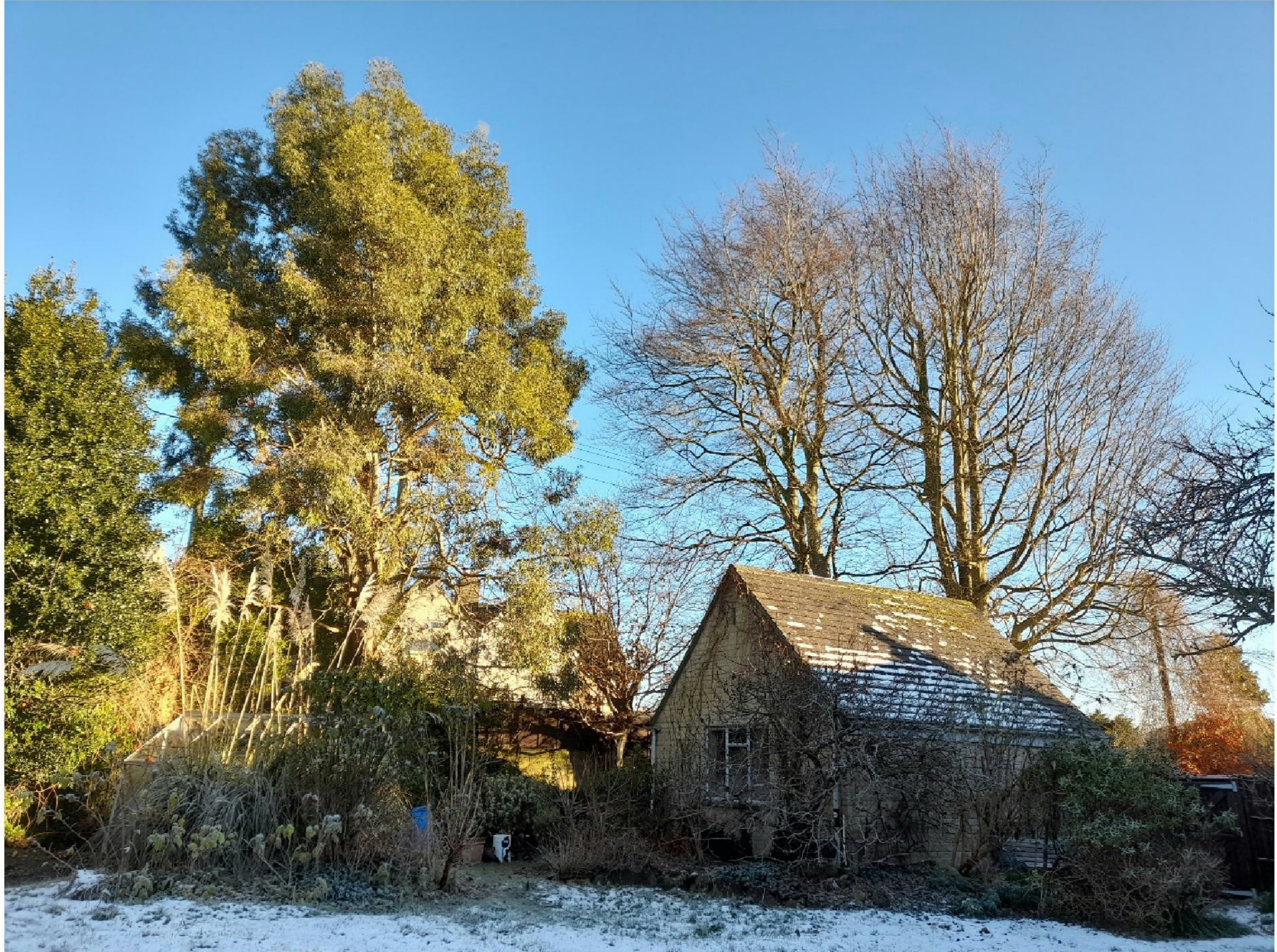
View from back of Ludloes. Holly tree (T1) to left of picture. At rear of garden, from left to right, Eucalyptus tree (T2), Beech tree (T3) to the left of the garage, Beech tree (T4) and Beech tree (T5) rising above garage roof.