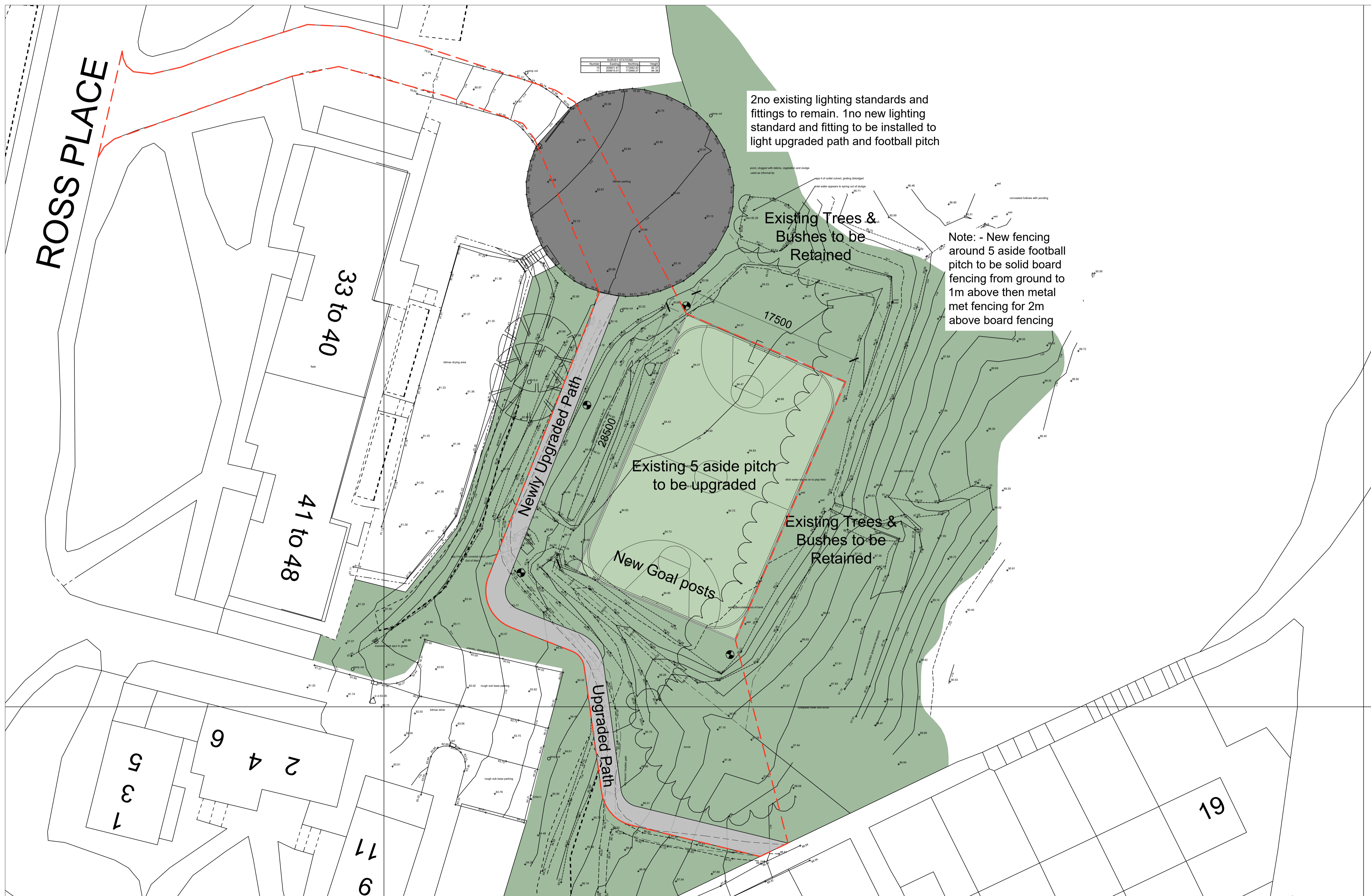
SITE PLAN - SCALE 1:200

Note : The contractor will be held to have checked all dimensions before commencing with any works and in the event of discrepancies, is to refer them directly to this office for clarification prior to commencement of work. Written dimensions are to be taken in all cases. Drawings should not be scaled for dimensions. In case of doubt refer to this office. This drawing is copyright and all rights are reserved. No unauthorised copying of this drawing is permitted.