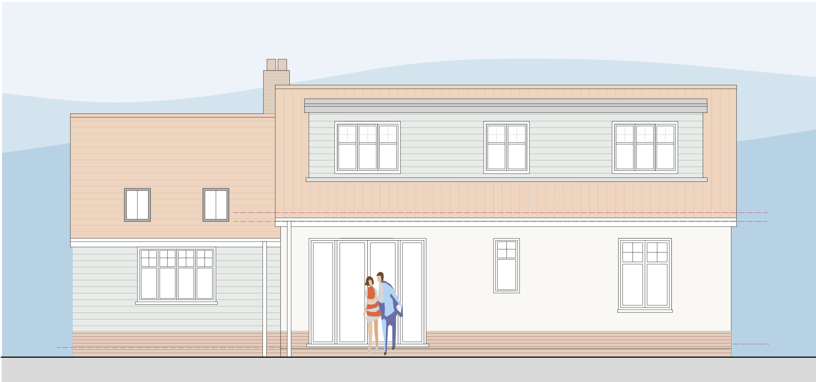
PROPOSED REAR (West) ELEVATION 1:50