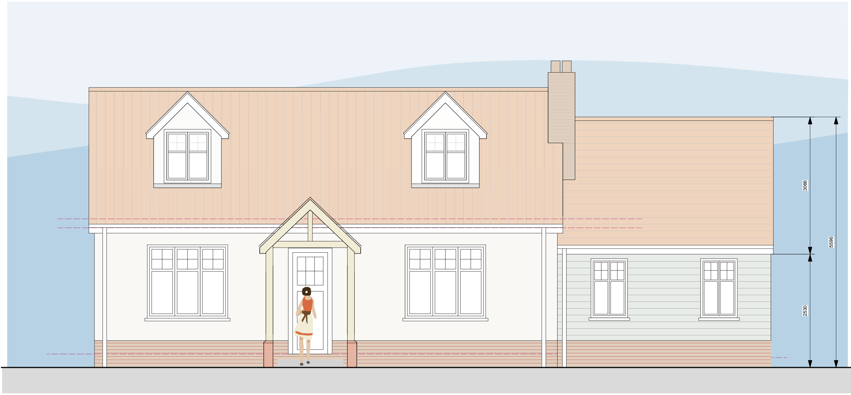
PROPOSED FRONT (East) ELEVATION 1:50