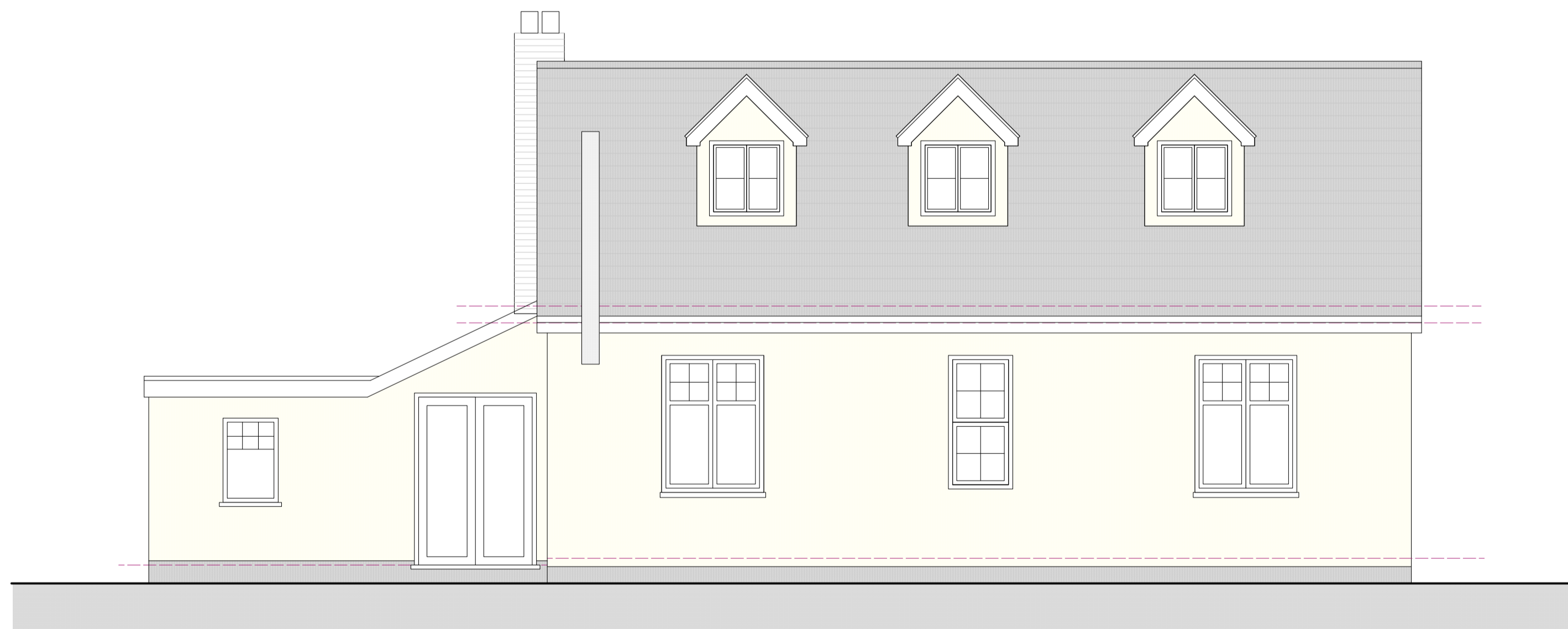
EXISTING REAR (West) ELEVATION 1:50