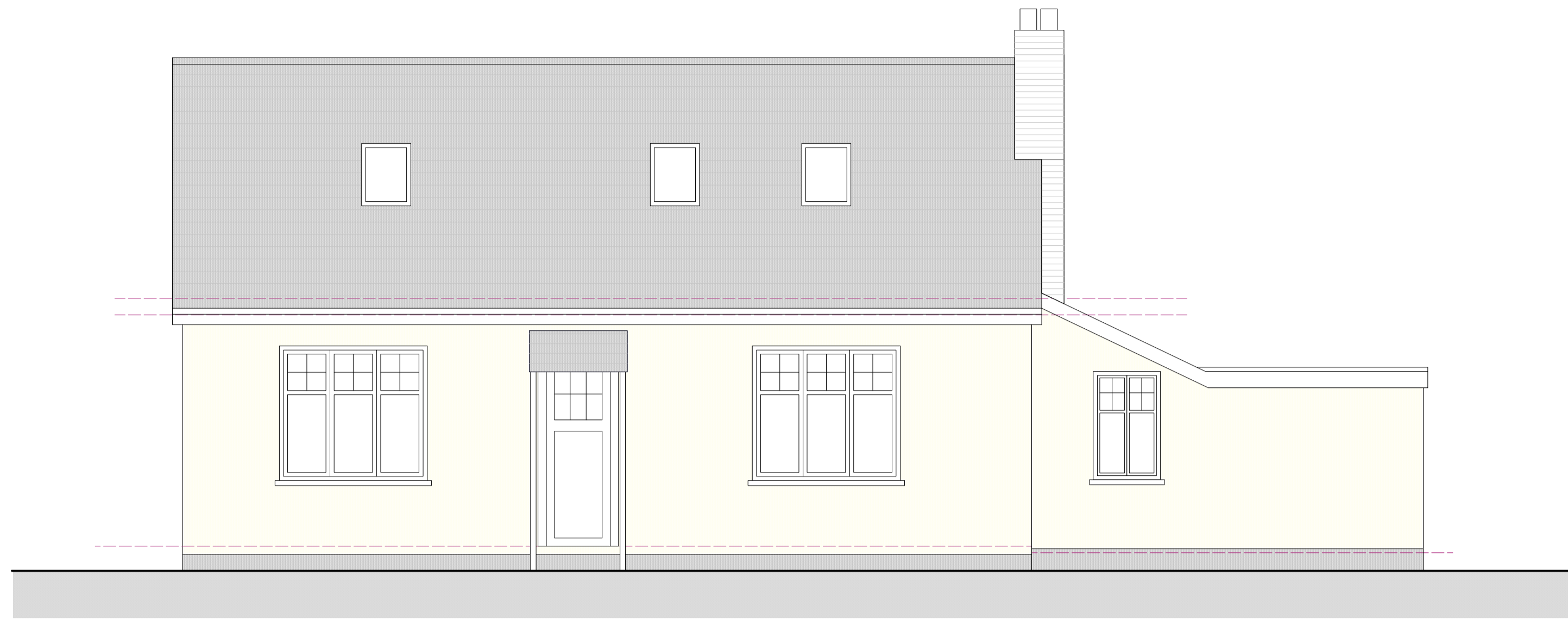
EXISTING FRONT (East) ELEVATION 1:50