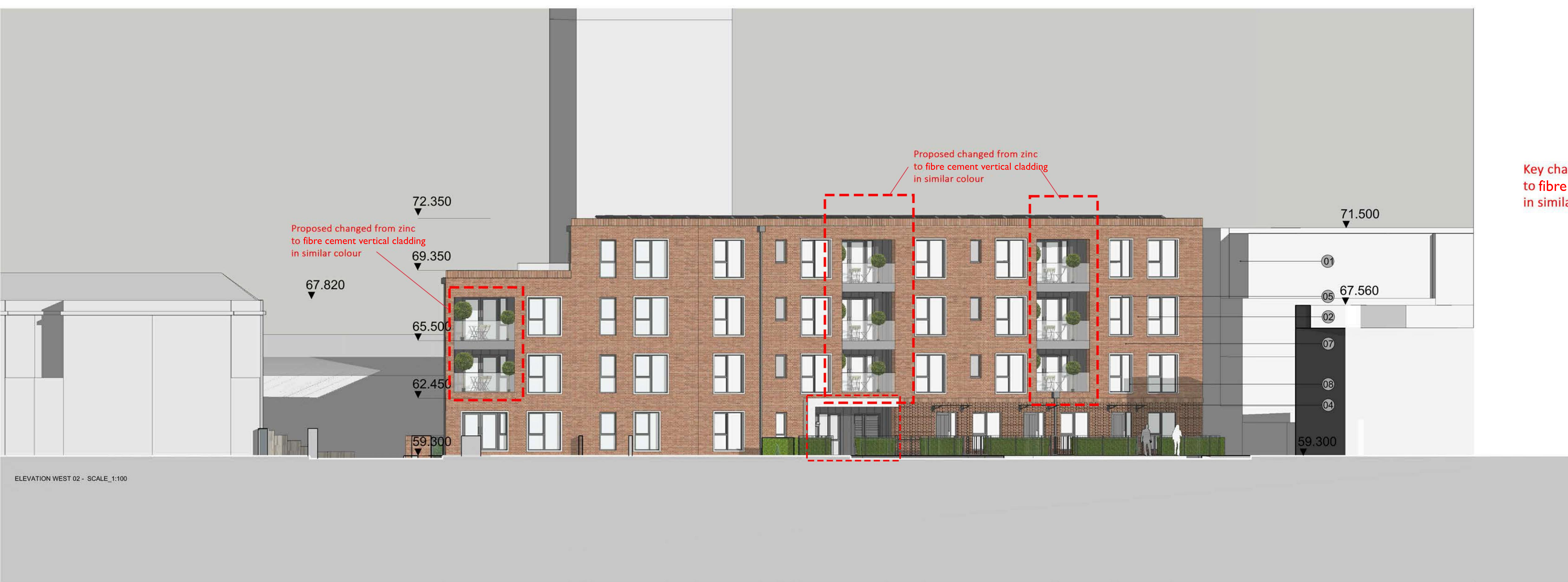
ELEVATION WEST 02 - SCALE_1:100