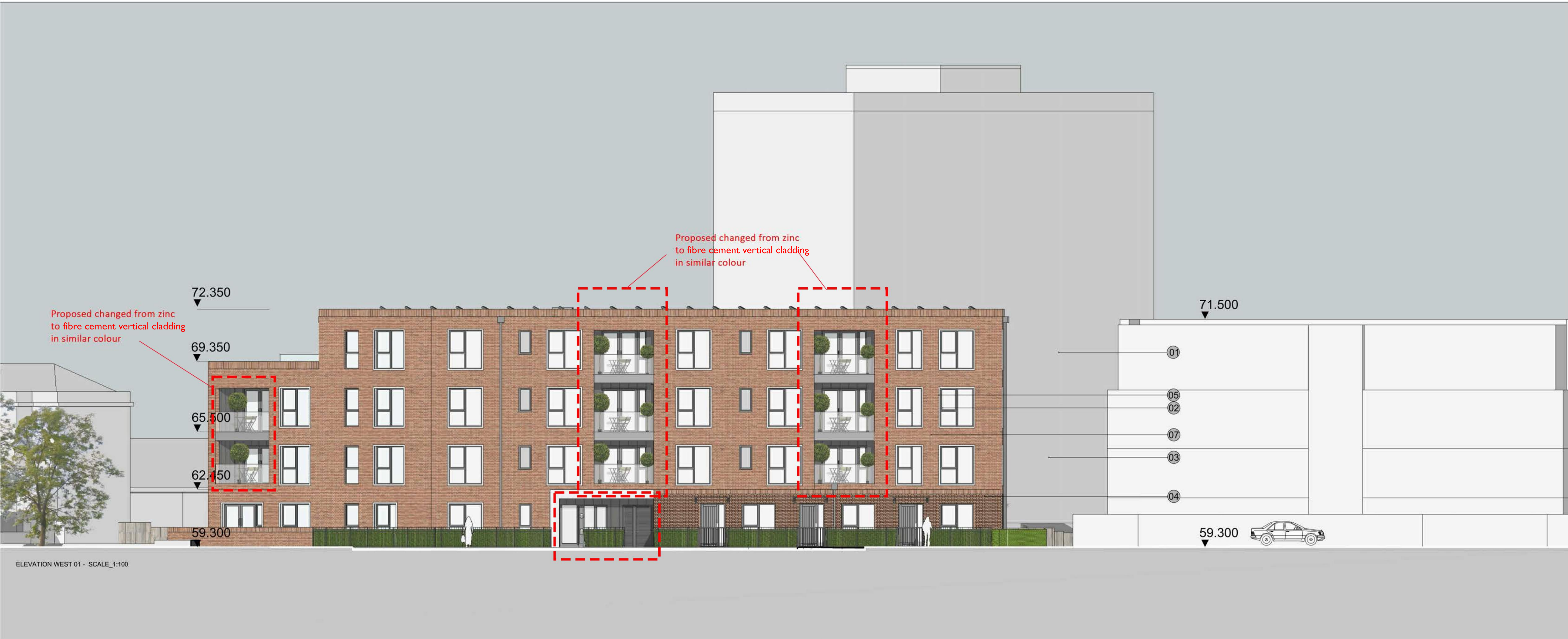
ELEVATION WEST 01 - SCALE_1:100