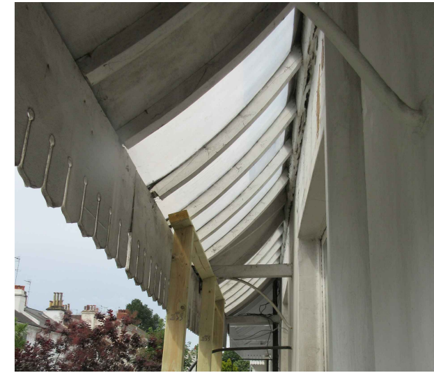
Fig 2: Underside of Front Canopy as Existing

Philip Hall Associates Chartered Building Surveyors