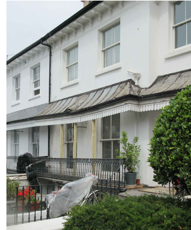
Fig 1: Front Canopy and Balcony as Existing