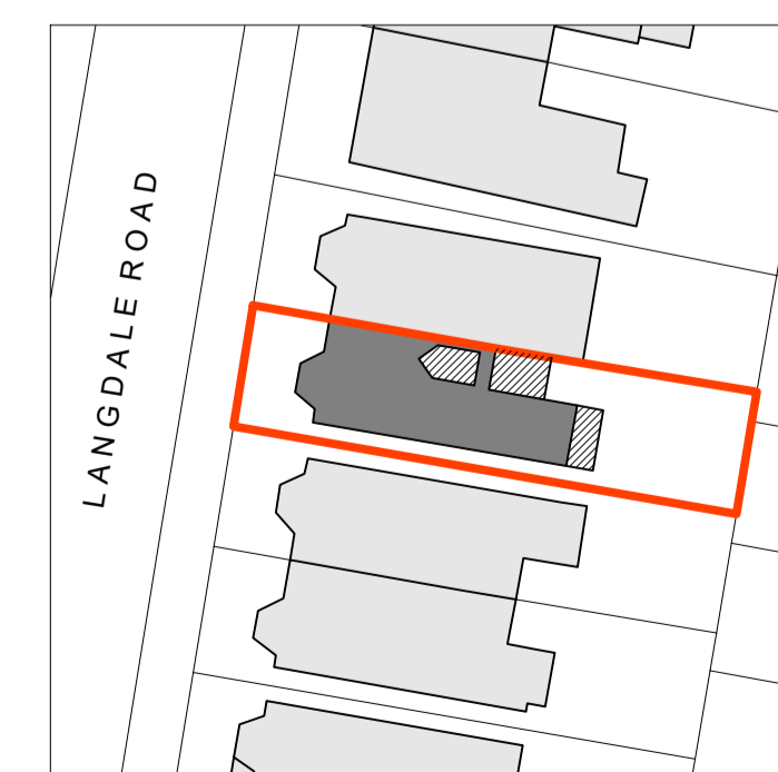
Site Plan 1:500 Scale In Metres