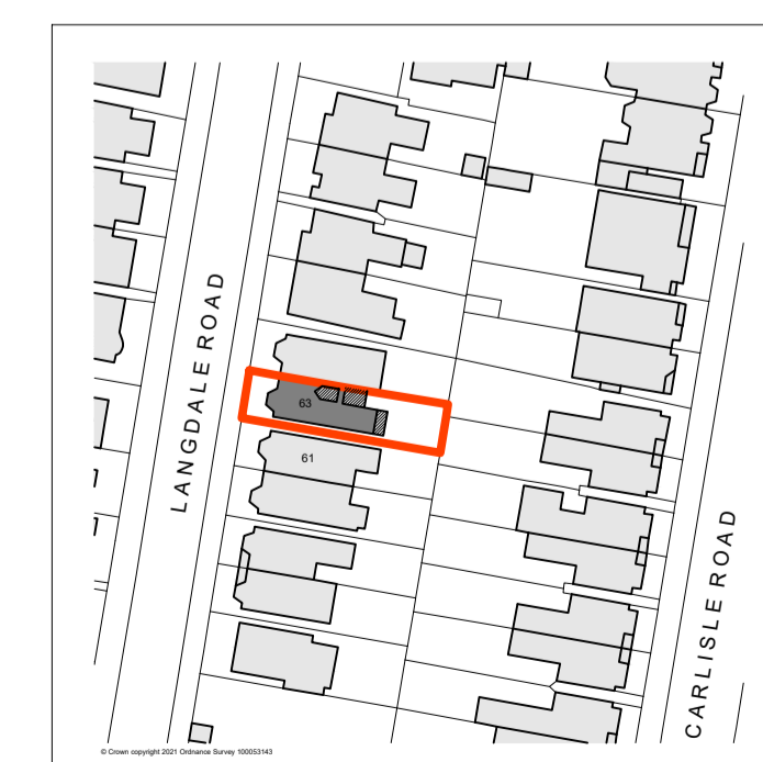
Location Plan 1:1250 Scale In Metres