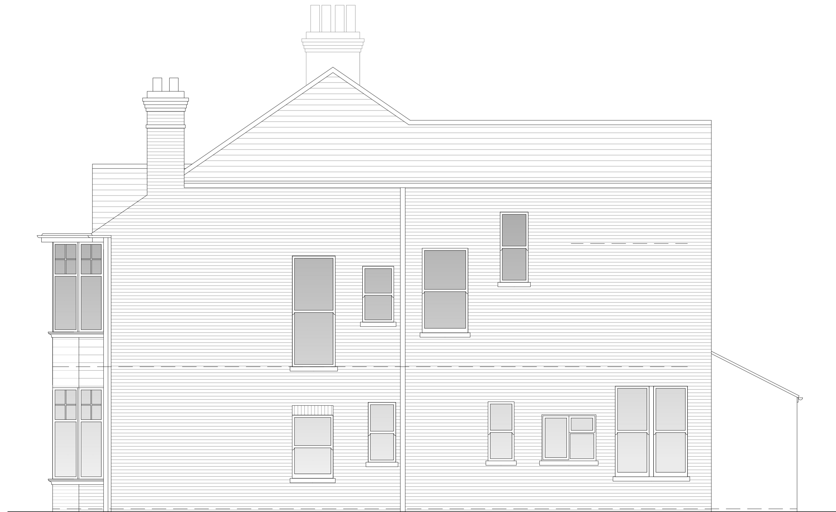
Existing Side Elevation (S) 1:50