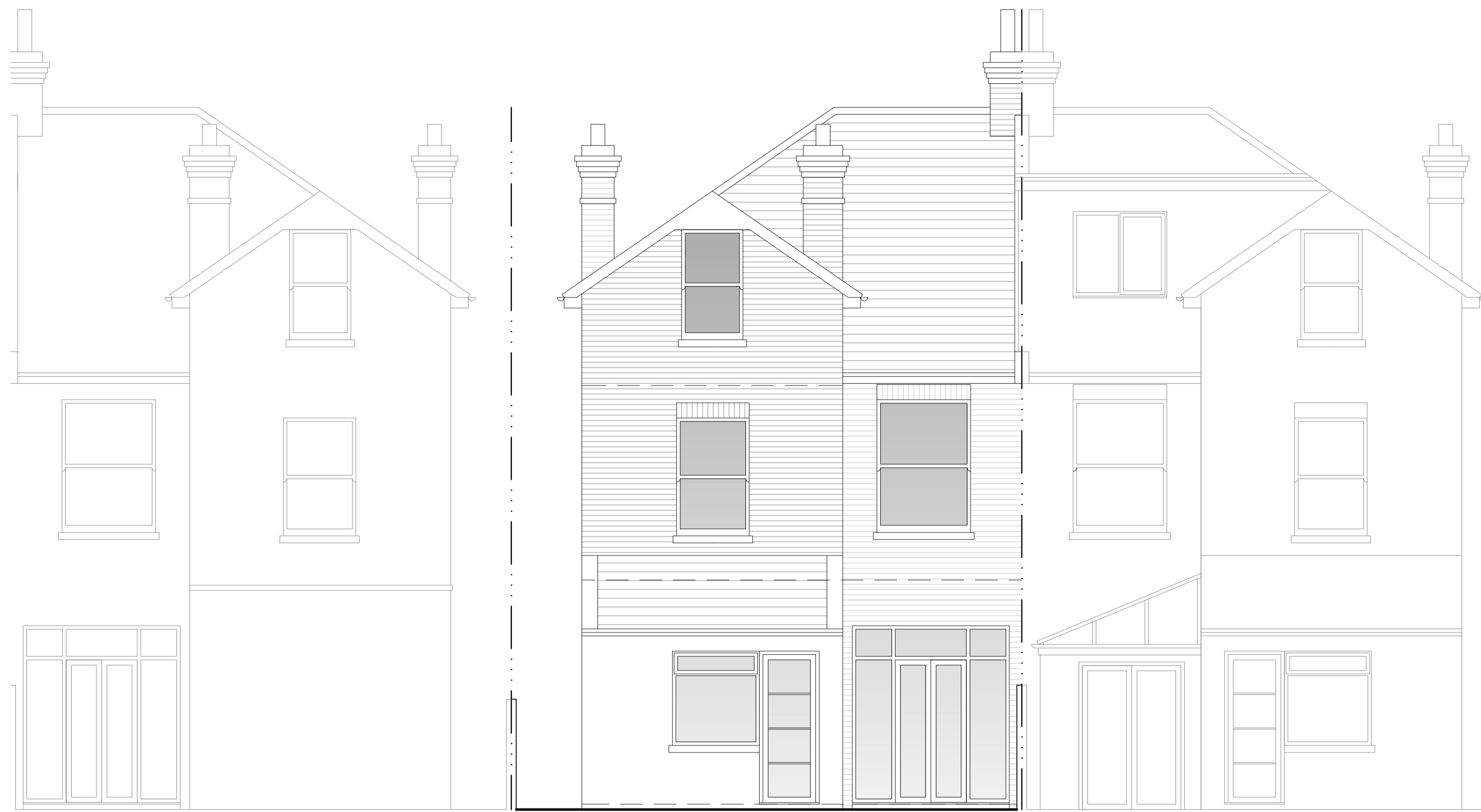
Existing Rear Elevation (E) 1:50