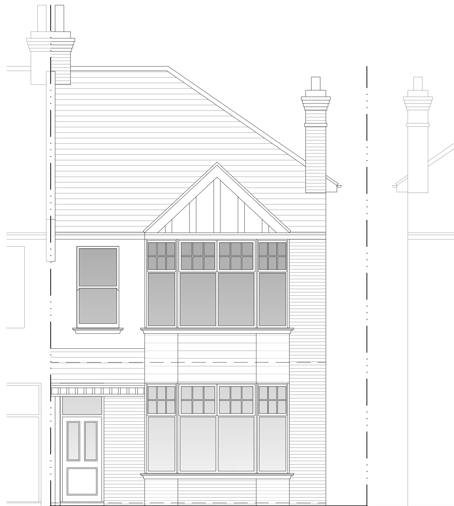
Existing Front Elevation (W) 1:50