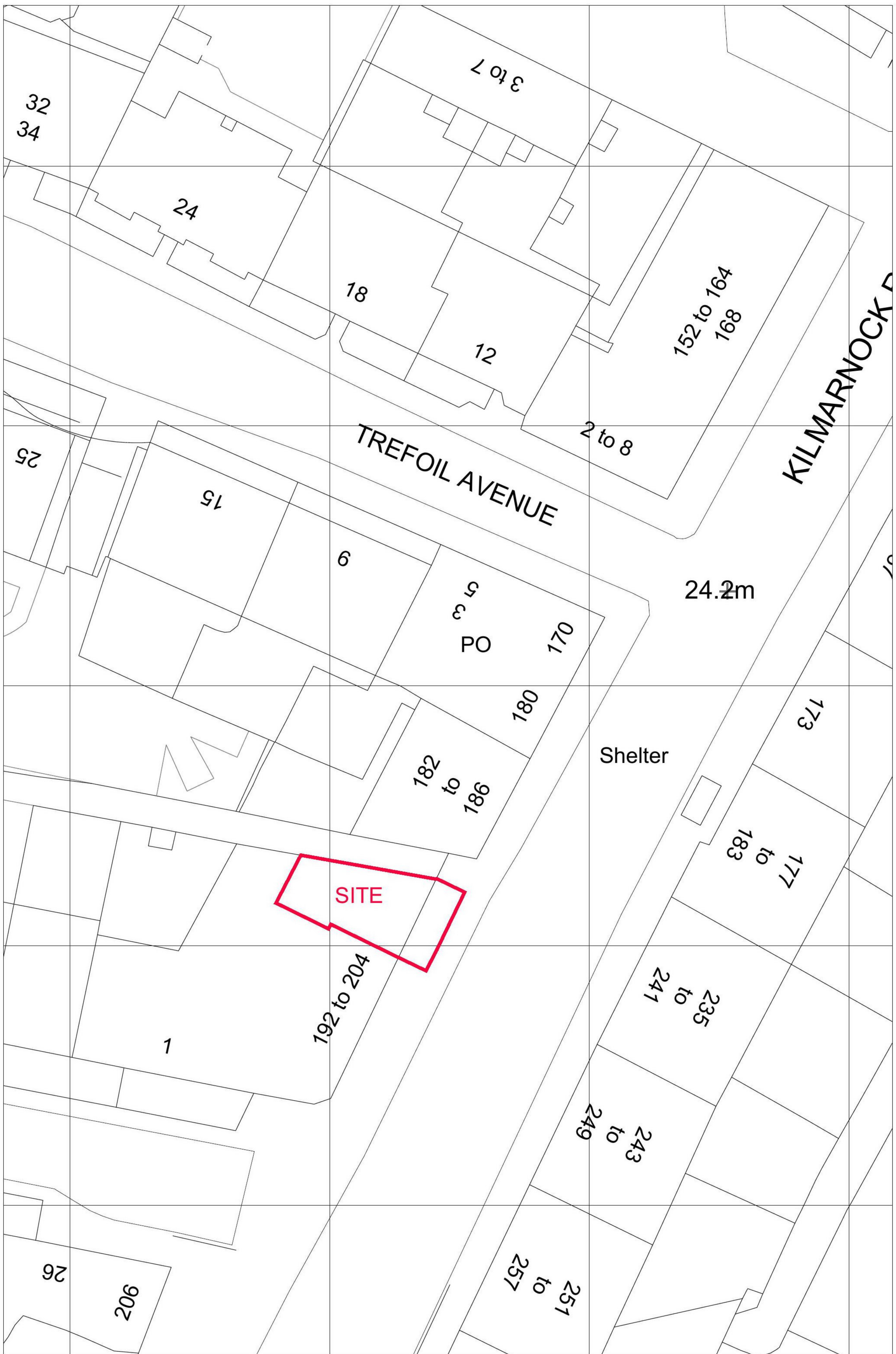
LOCATION PLAN (1:500 @ A3)