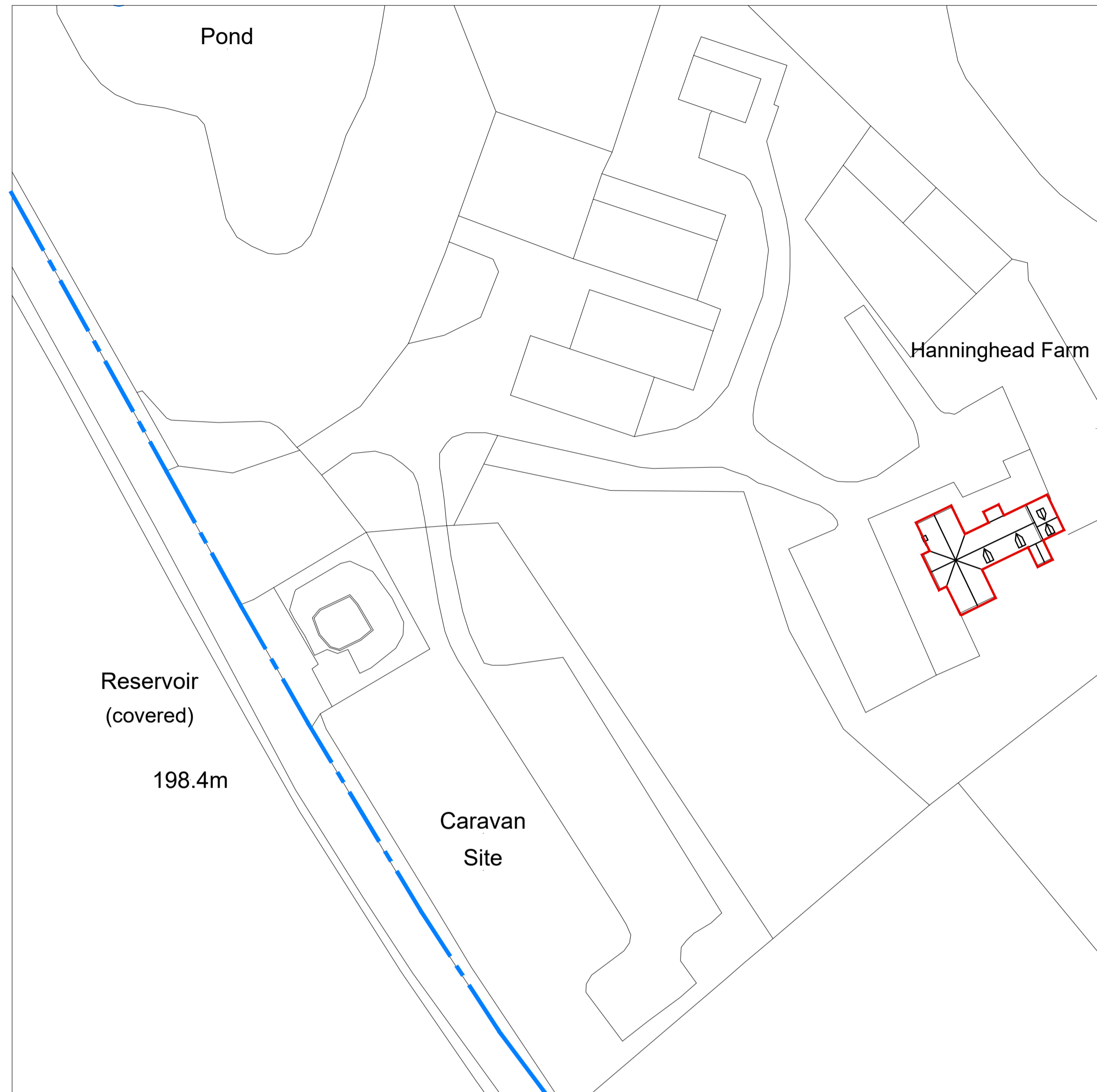
Extg Site Plan - 1:500