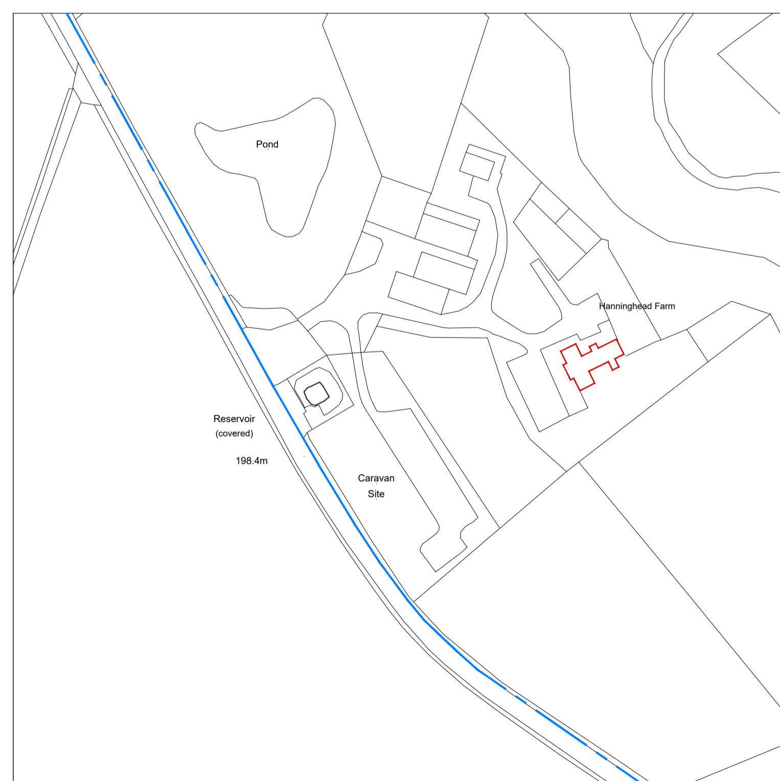
Site Location Plan - 1:1250

©Crown Copyright and database rights 2020 OS Licence no. 100019980