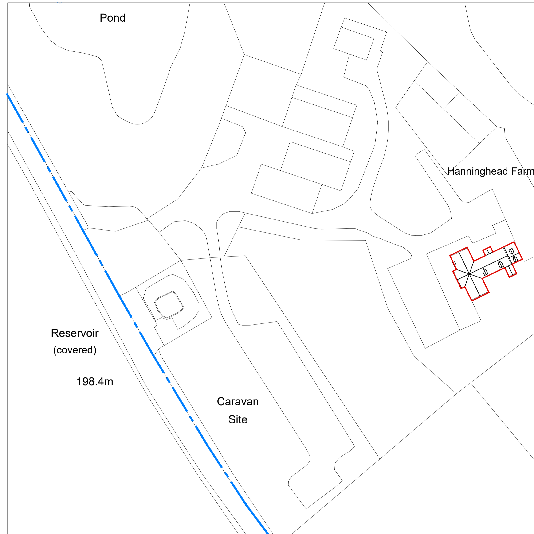
Proposed Site Plan - 1:500