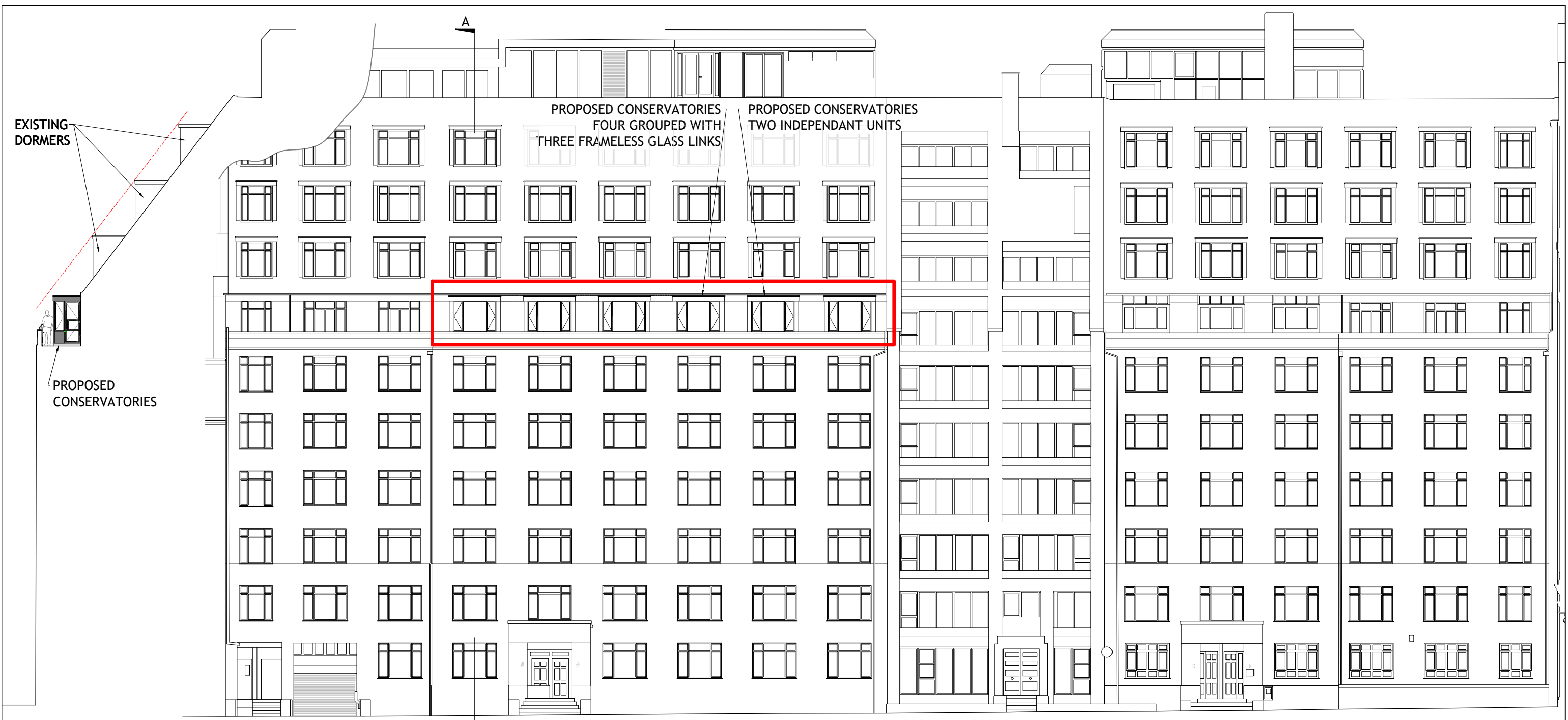
PART SECTION AA