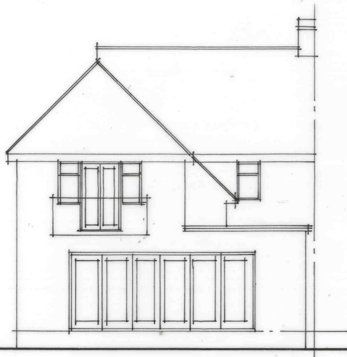
Approved Rear Elevation.