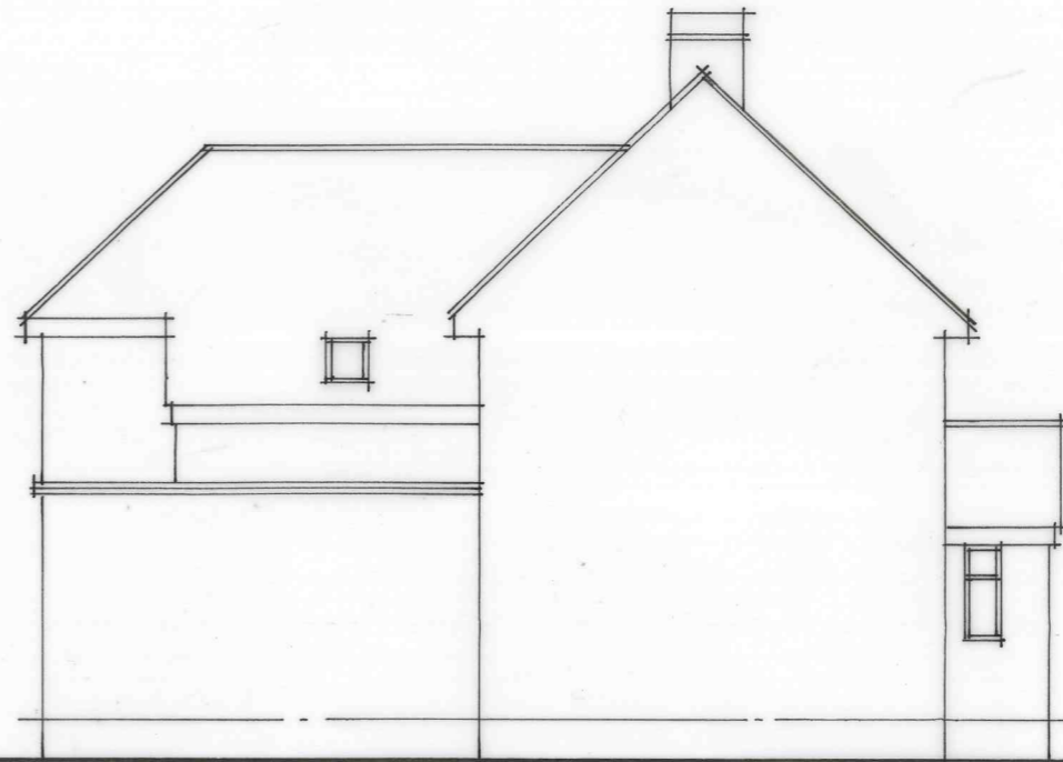
Approved Side Elevation.