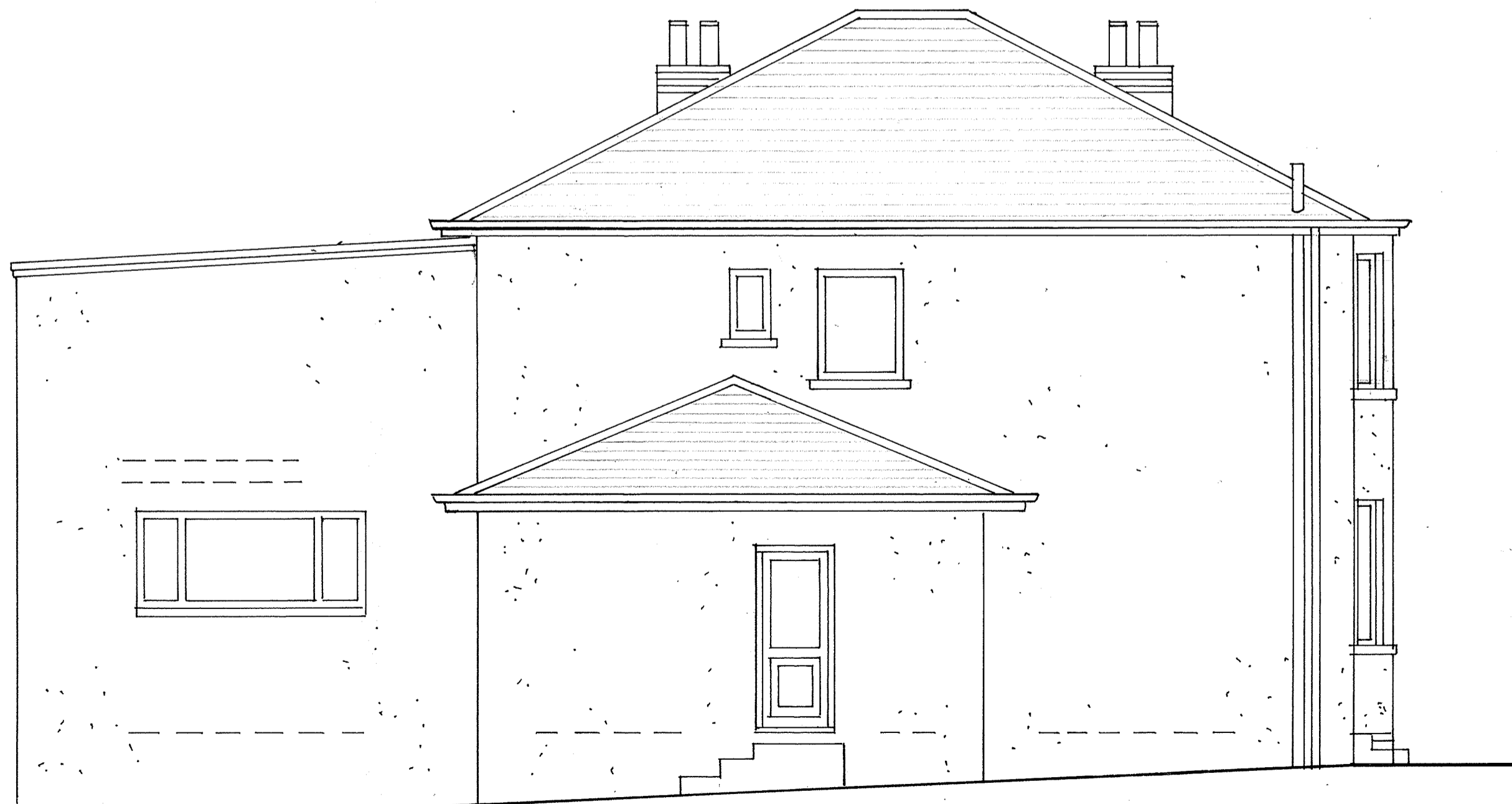
SIDE ELEVATION AS EXISTING