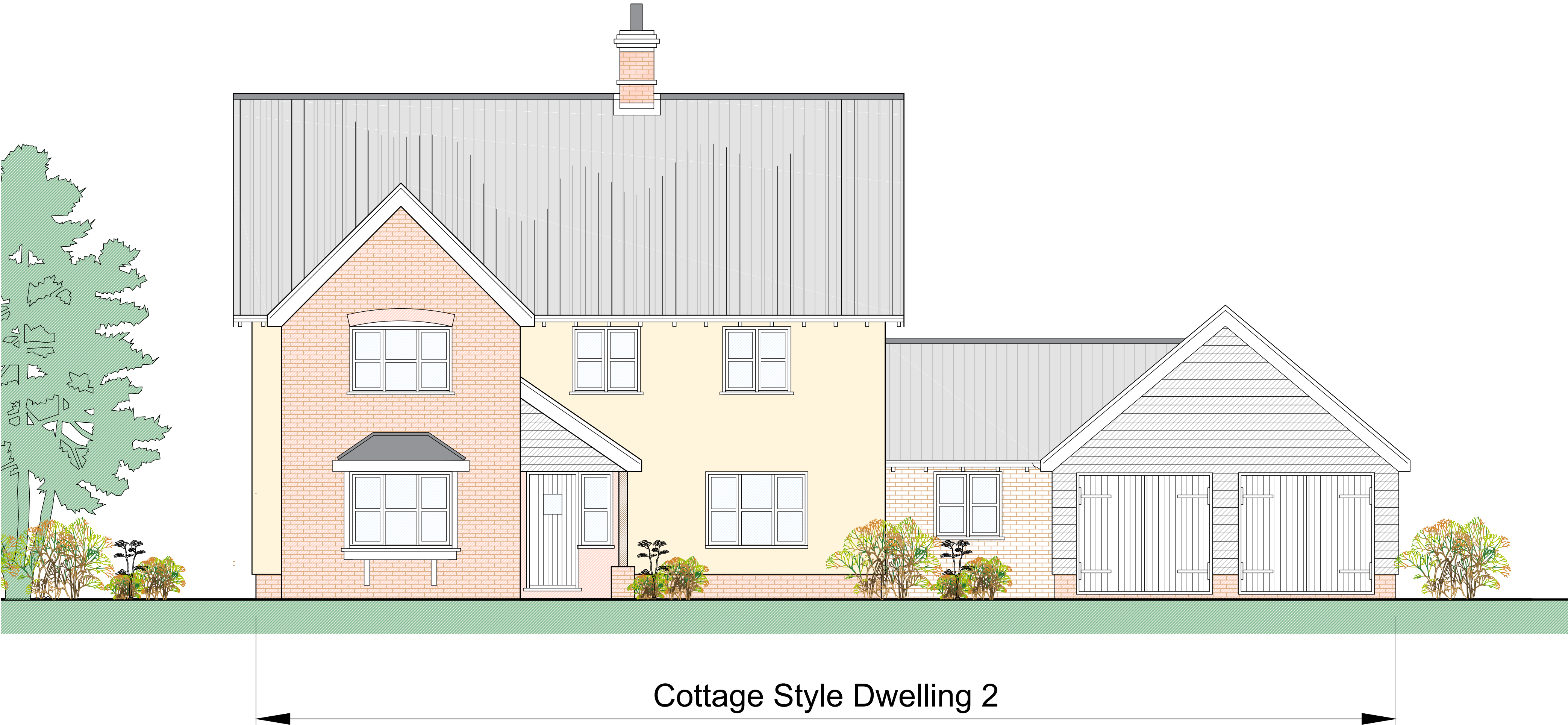
Cottage Style Dwelling 2