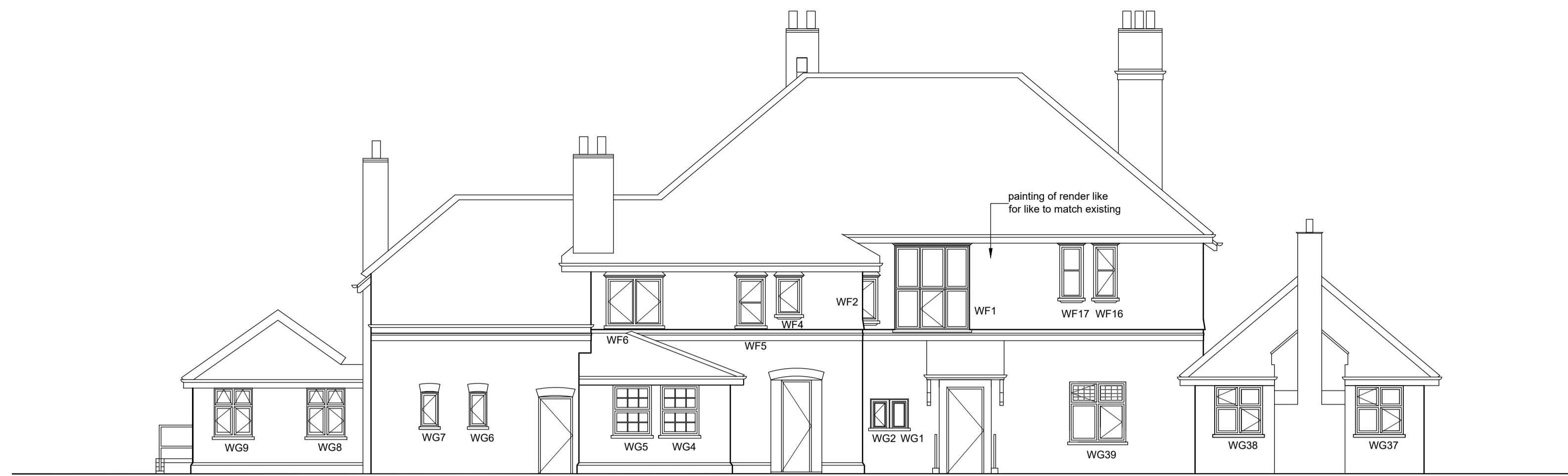
North West - Front Elevation