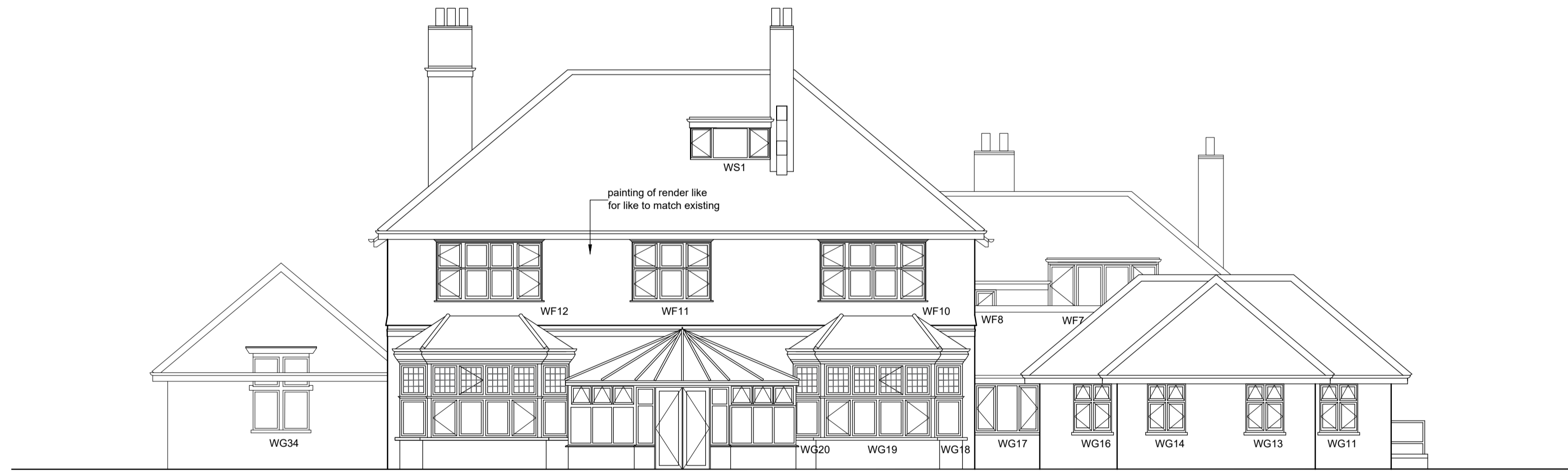
South East - Rear Elevation