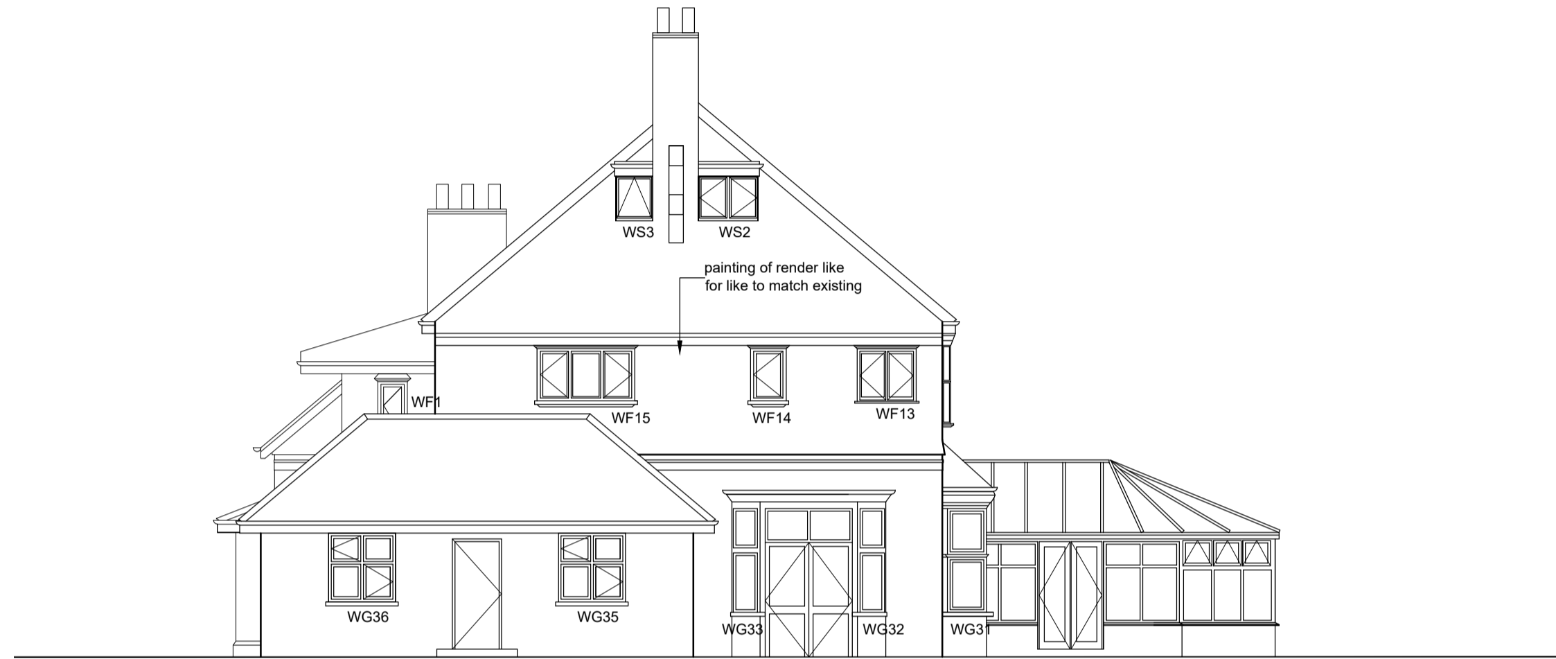
South West - Side Elevation