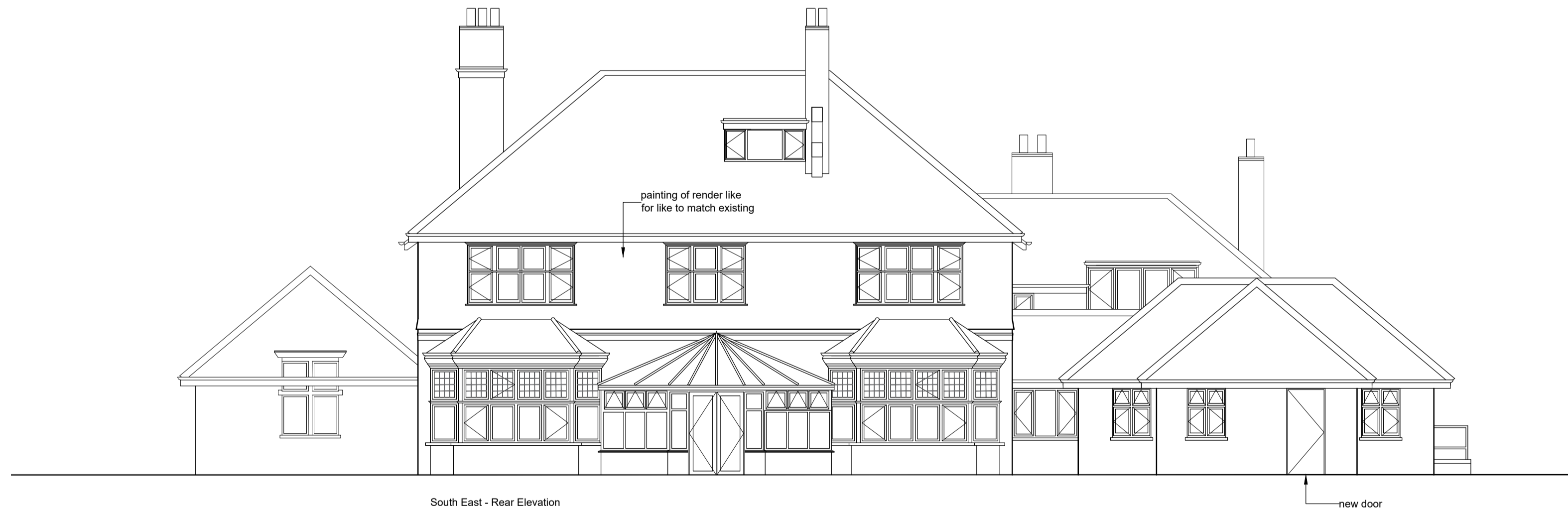
South East - Rear Elevation