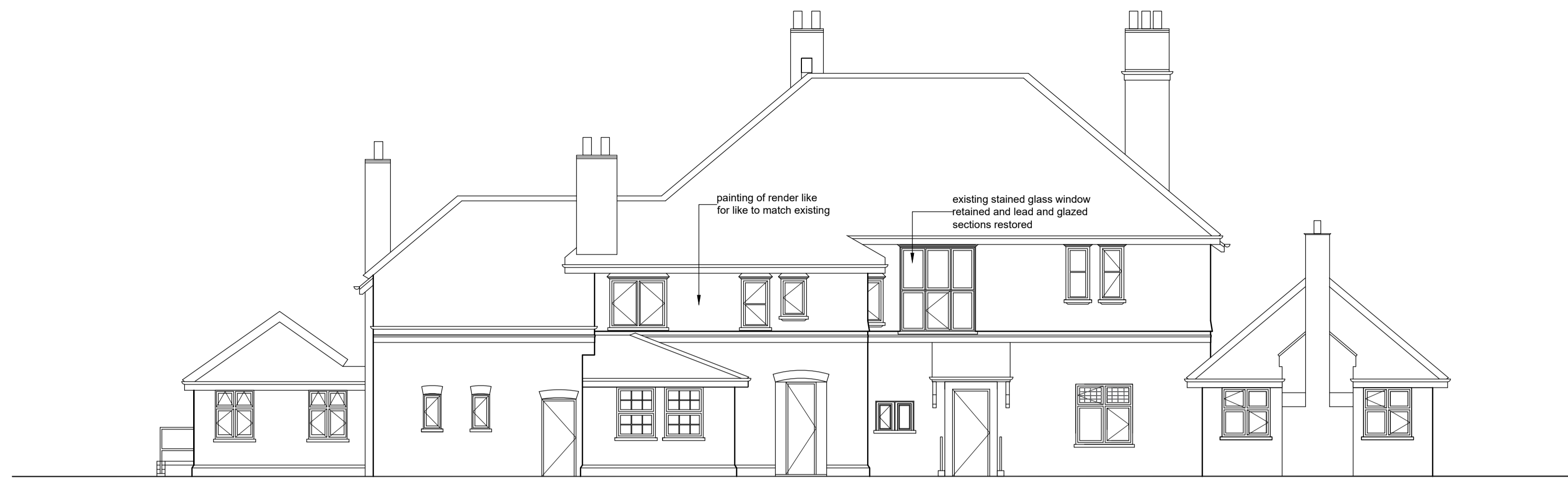
North West - Front Elevation