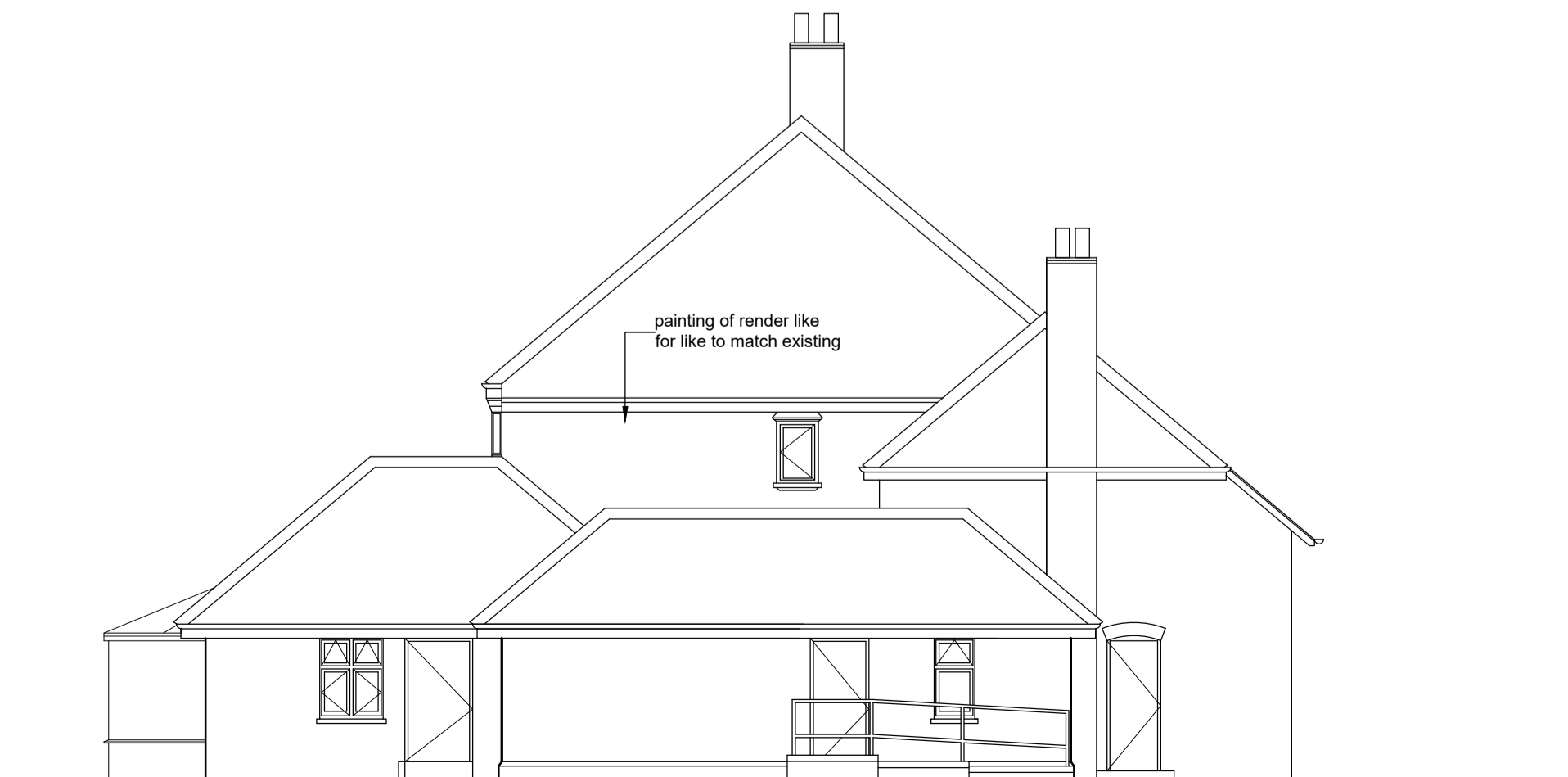
North East - Side Elevation