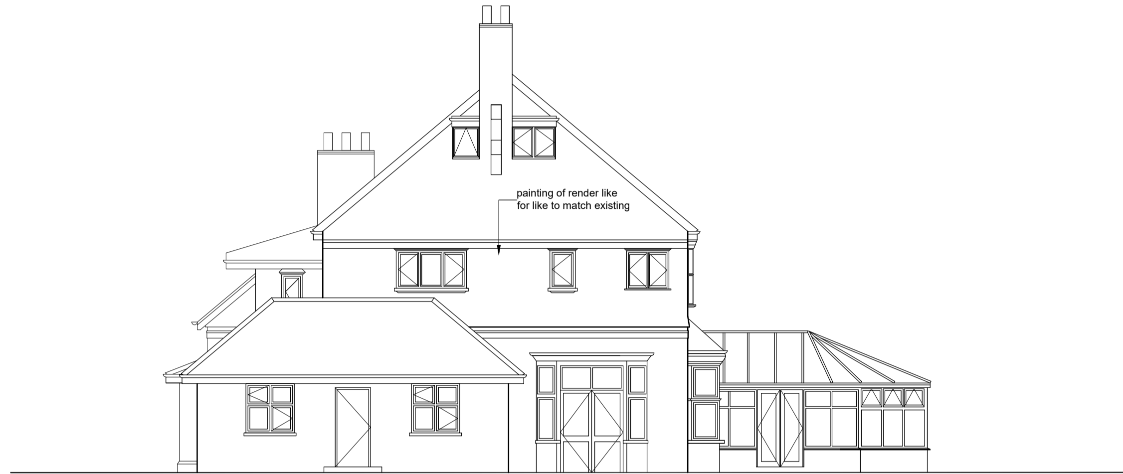
South West - Side Elevation