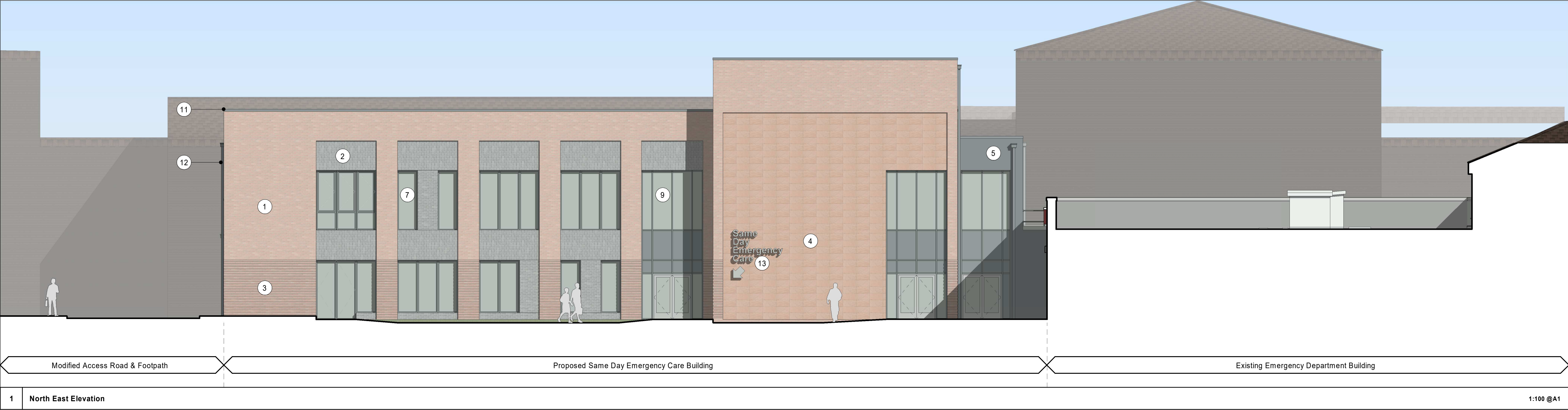
1 North East Elevation 1:100 @A1