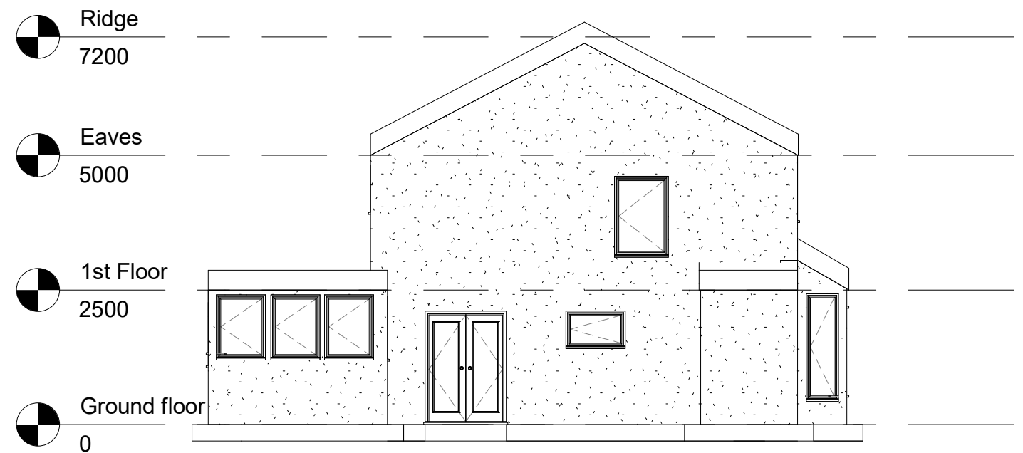
4 Side 1 : 100