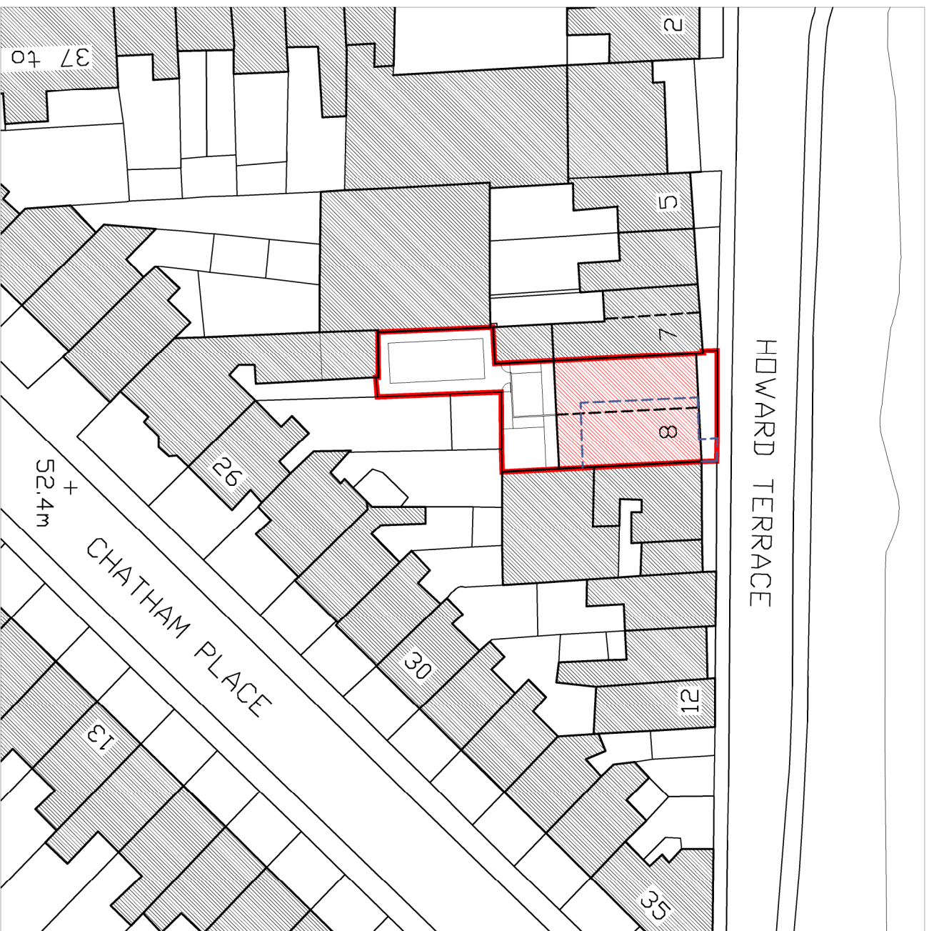
Proposed Block Plan Scale 1:500 @ A3