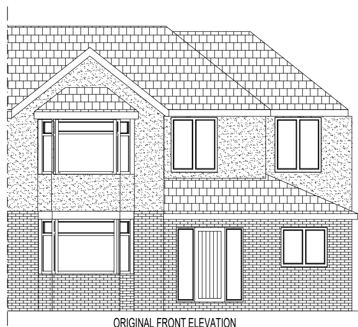
ORIGINAL FRONT ELEVATION