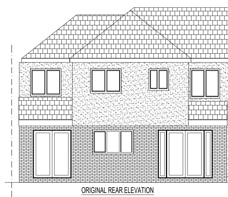
ORIGINAL REAR ELEVATION

THIS DRAWING IS THE COPYRIGHT OF WSD DRAUGHTING AND CANNOT BE PRINTED OR REPRODUCED WITHOUT PRIOR PERMISSION.