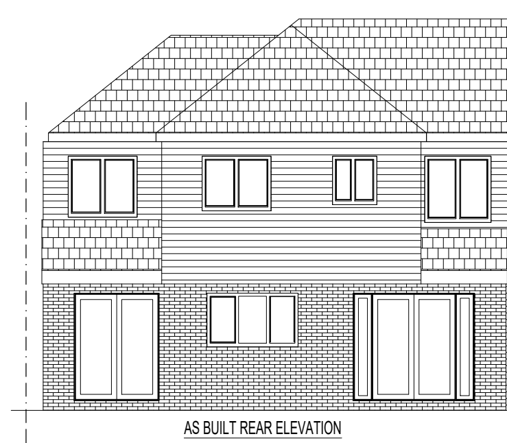
AS BUILT REAR ELEVATION