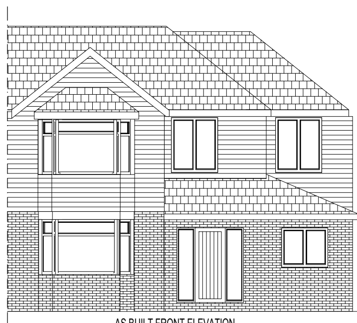
AS BUILT FRONT ELEVATION