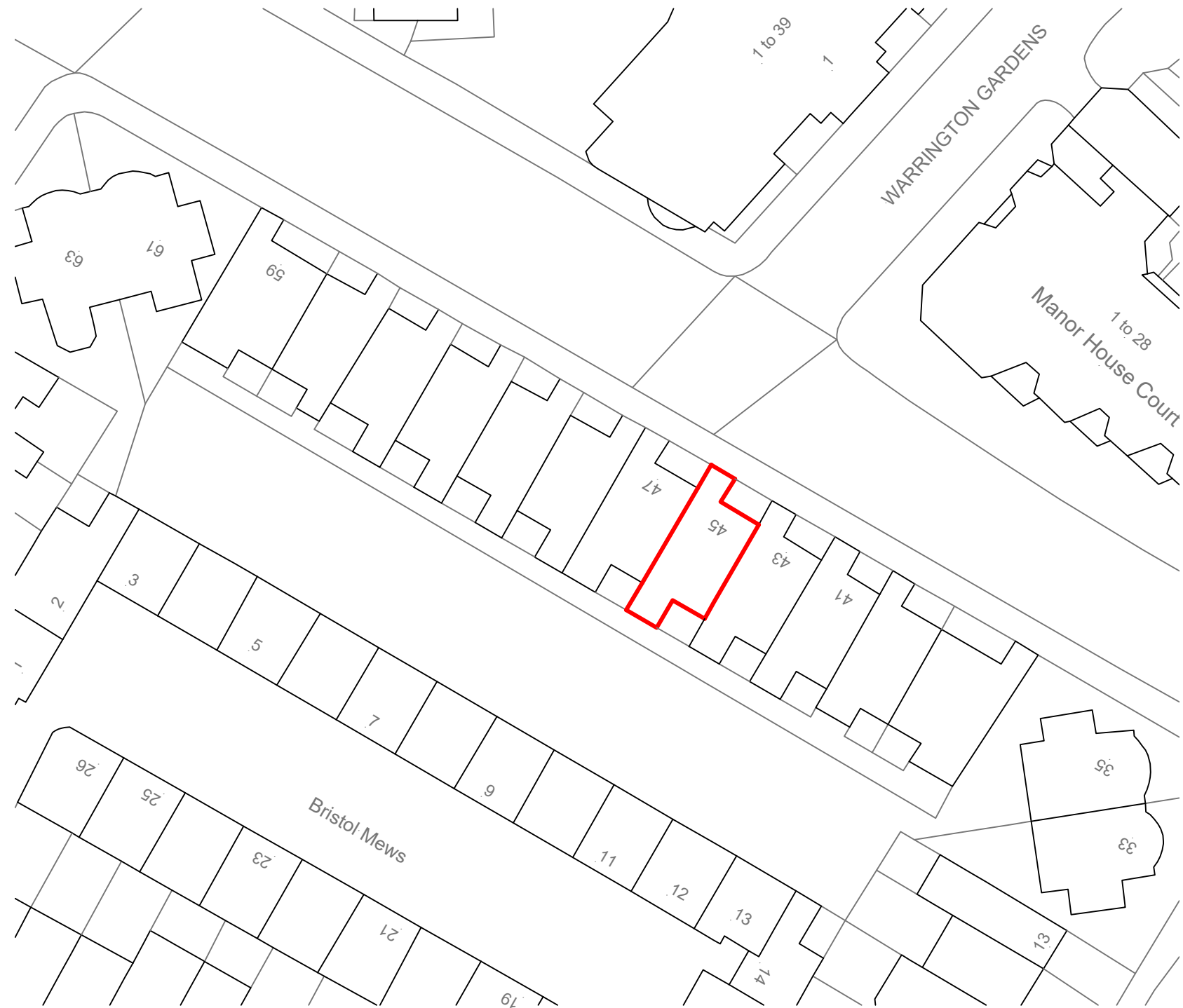
Block Plan – Scale 1:500