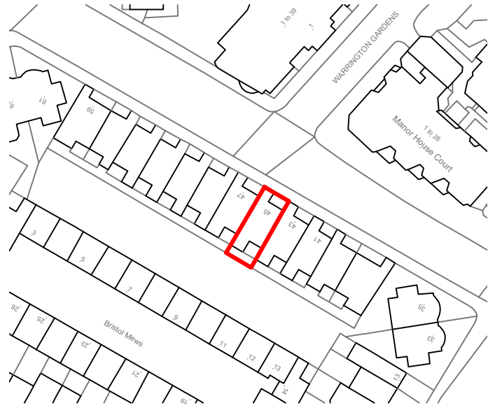
Site Plan – Scale 1:1250