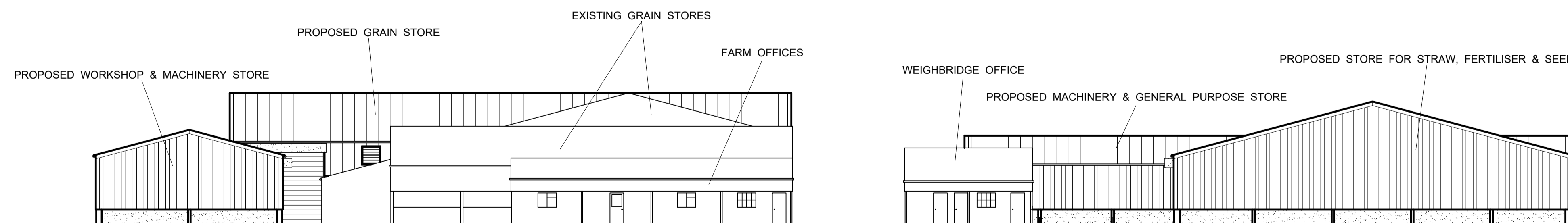
NORTH - WEST ELEVATION