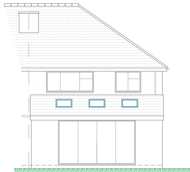
REAR ELEVATION - PROPOSED