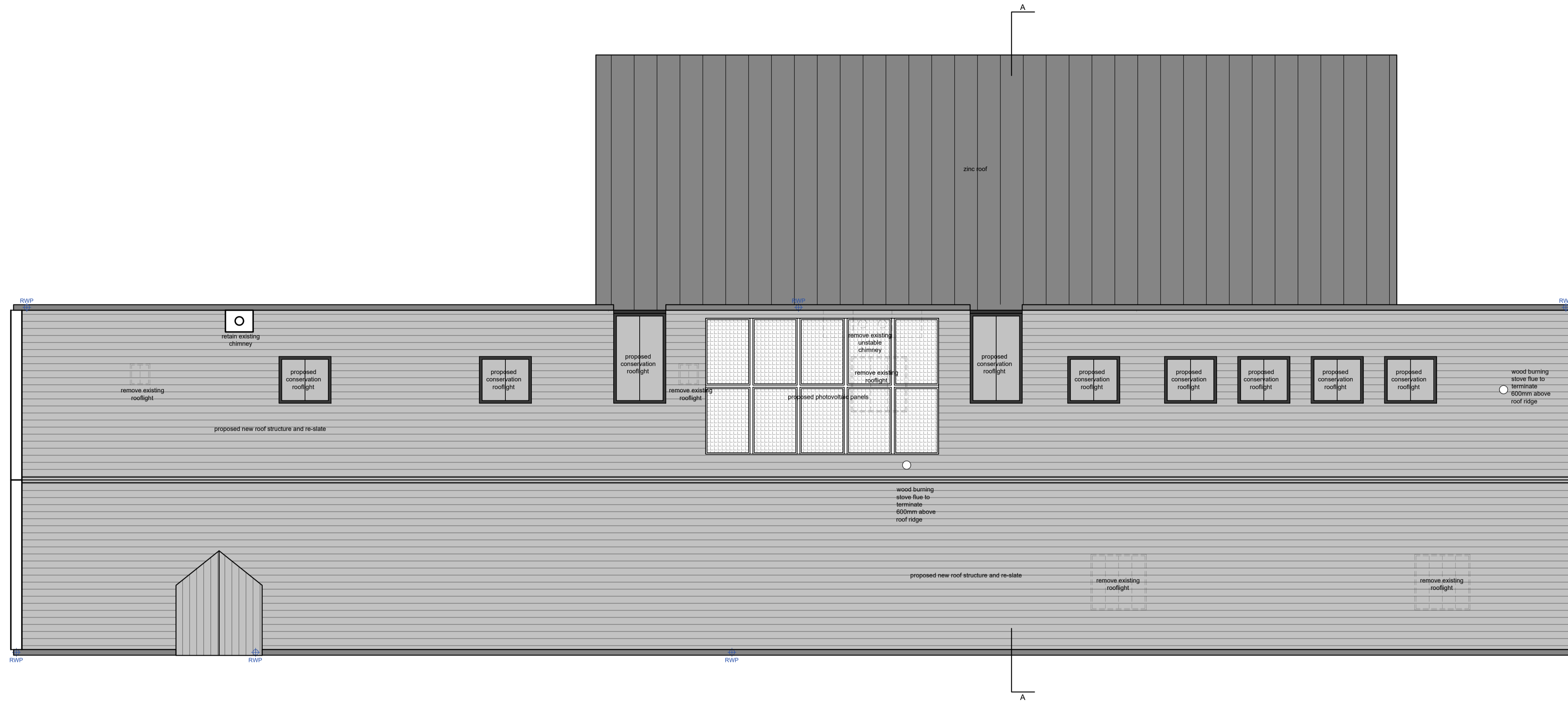
ROOF PLAN AS PROPOSED 1:50 on A1

GUTTERS/DOWNPIPES: existing coach house to have grey aluminum gutters and downpipes. extension to have slimline land drain.