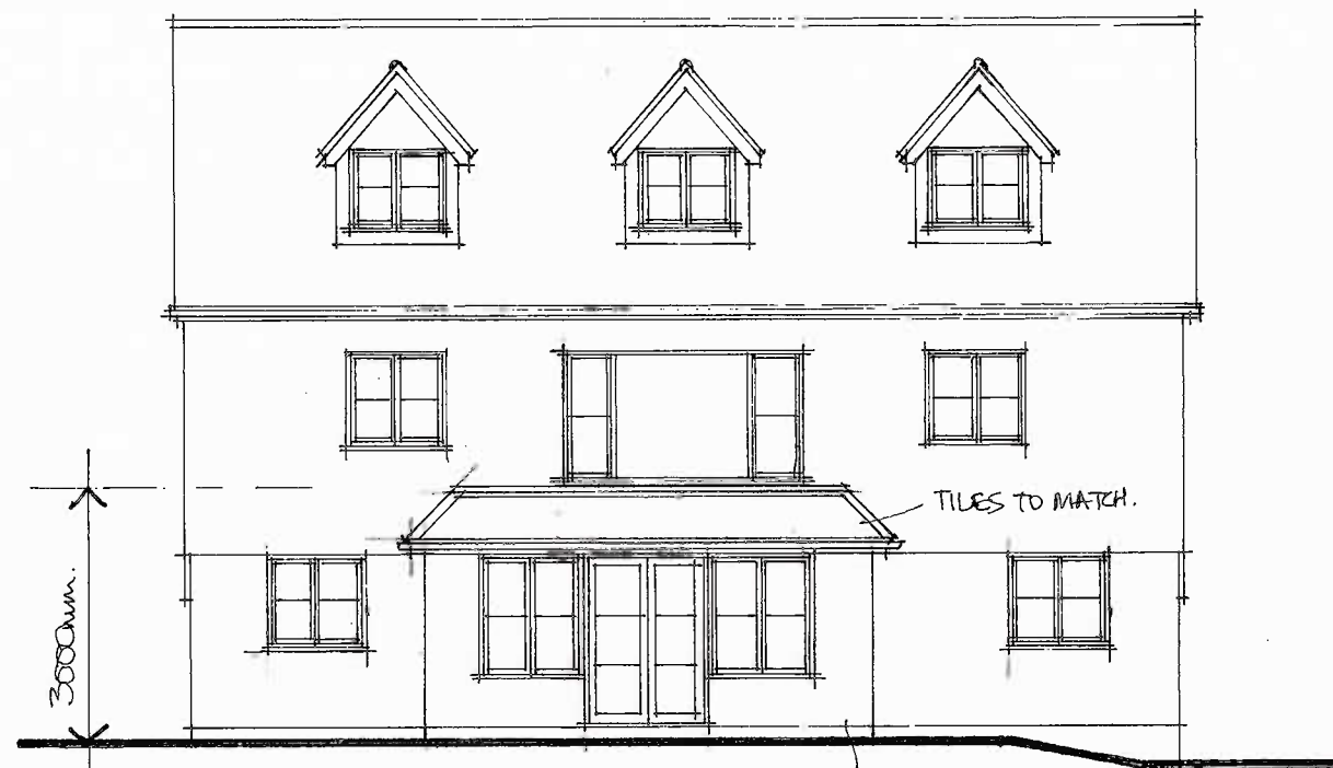
rear (north west) 1:100.