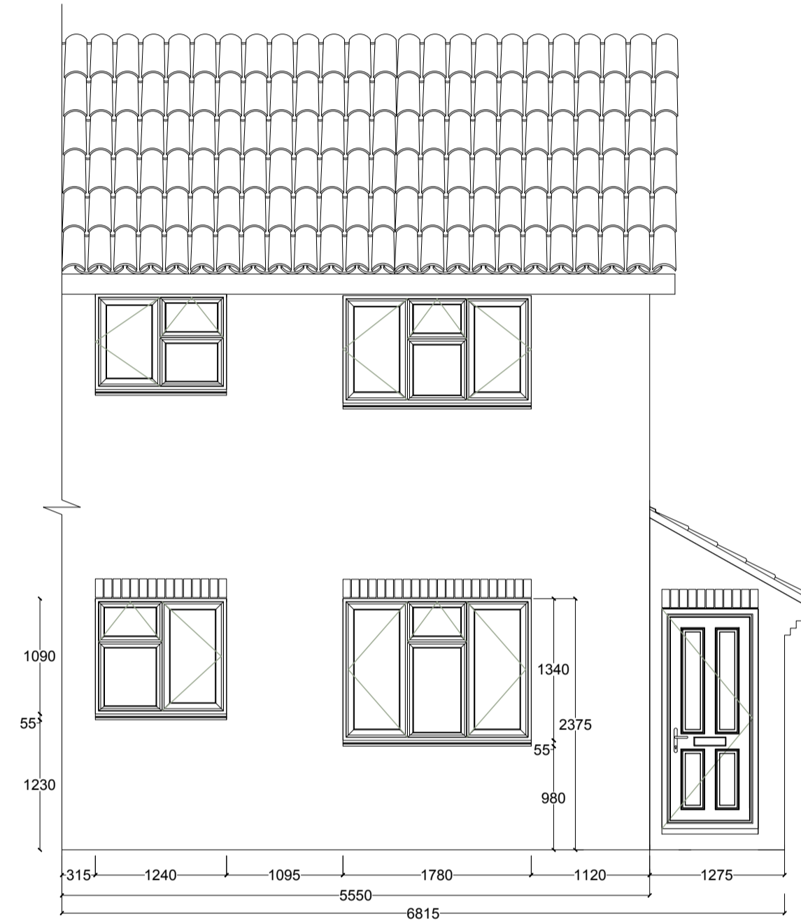
01 EXISTING EXTERNAL ELEVATION (A) Scale: 1:50 @ A1