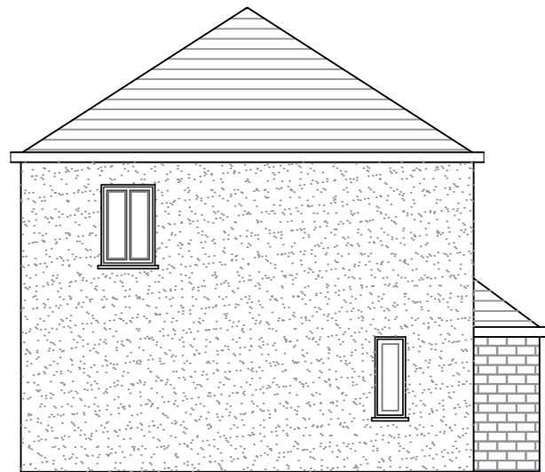
101 FEENAN HIGHWAY SIDE ELEVATION (A)