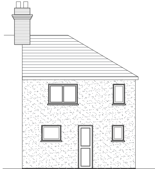
101 FEENAN HIGHWAY REAR ELEVATION