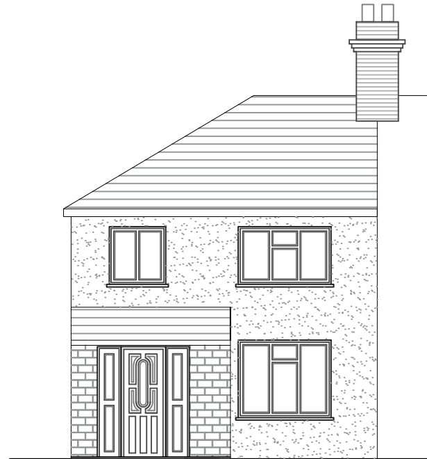
101 FEENAN HIGHWAY FRONT ELEVATION

ALL DIMENSIONS TO BE CHECKED ON THE DRAWING AND ON THE SITE BY THE NOMINATED CONTRACTOR ALL DISCREPANCIES ARE TO BE NOTIFIED TO THE CLIENT.