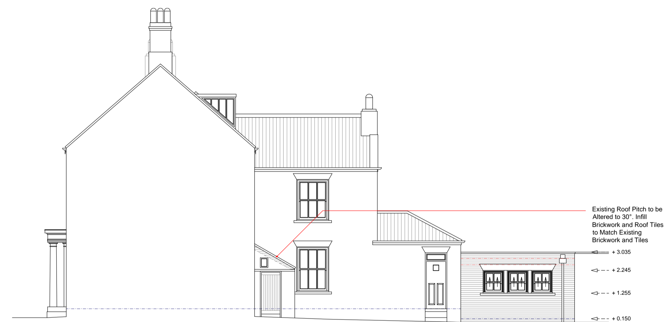
Proposed Inner Side Elevation 1:100