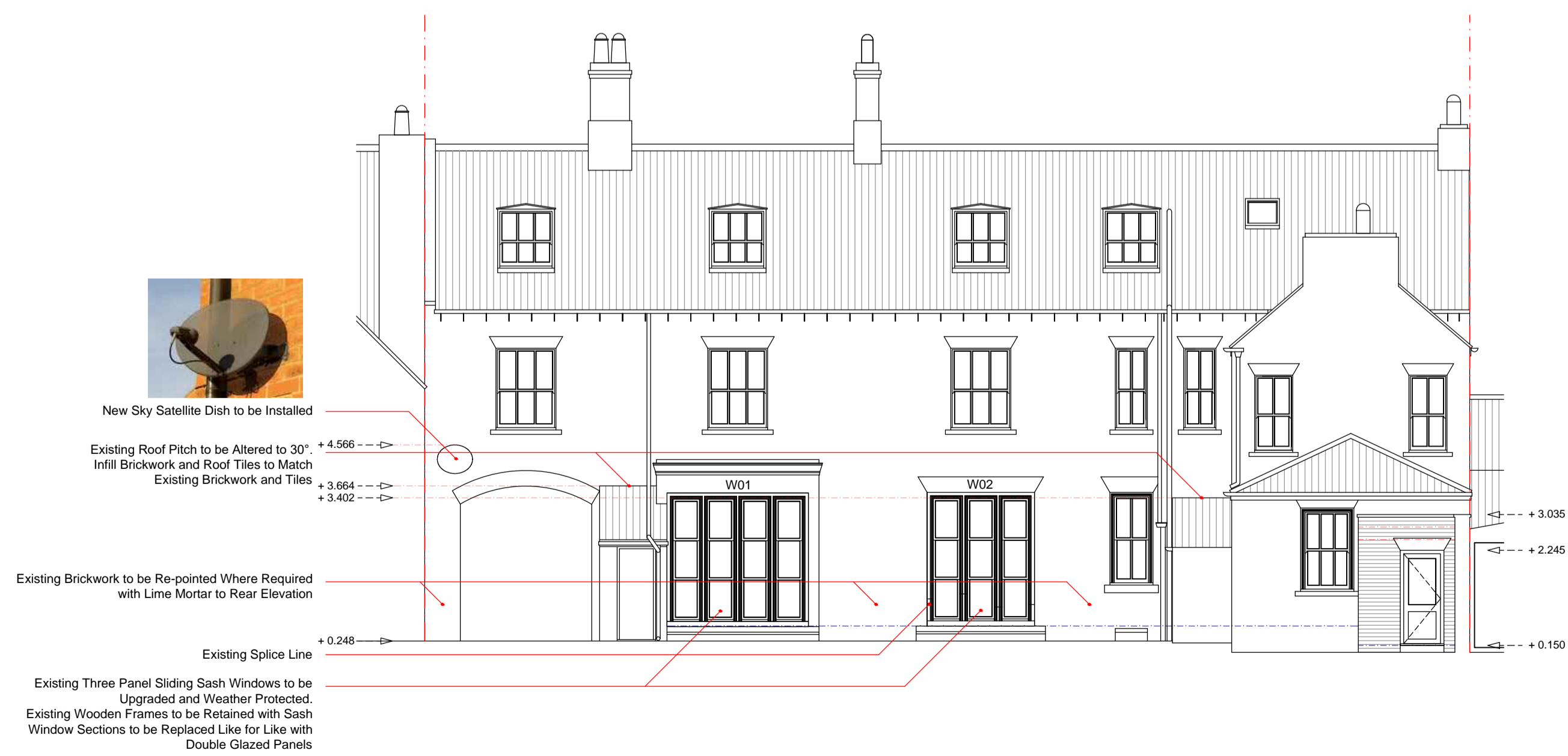
Proposed Rear Elevation 1:100