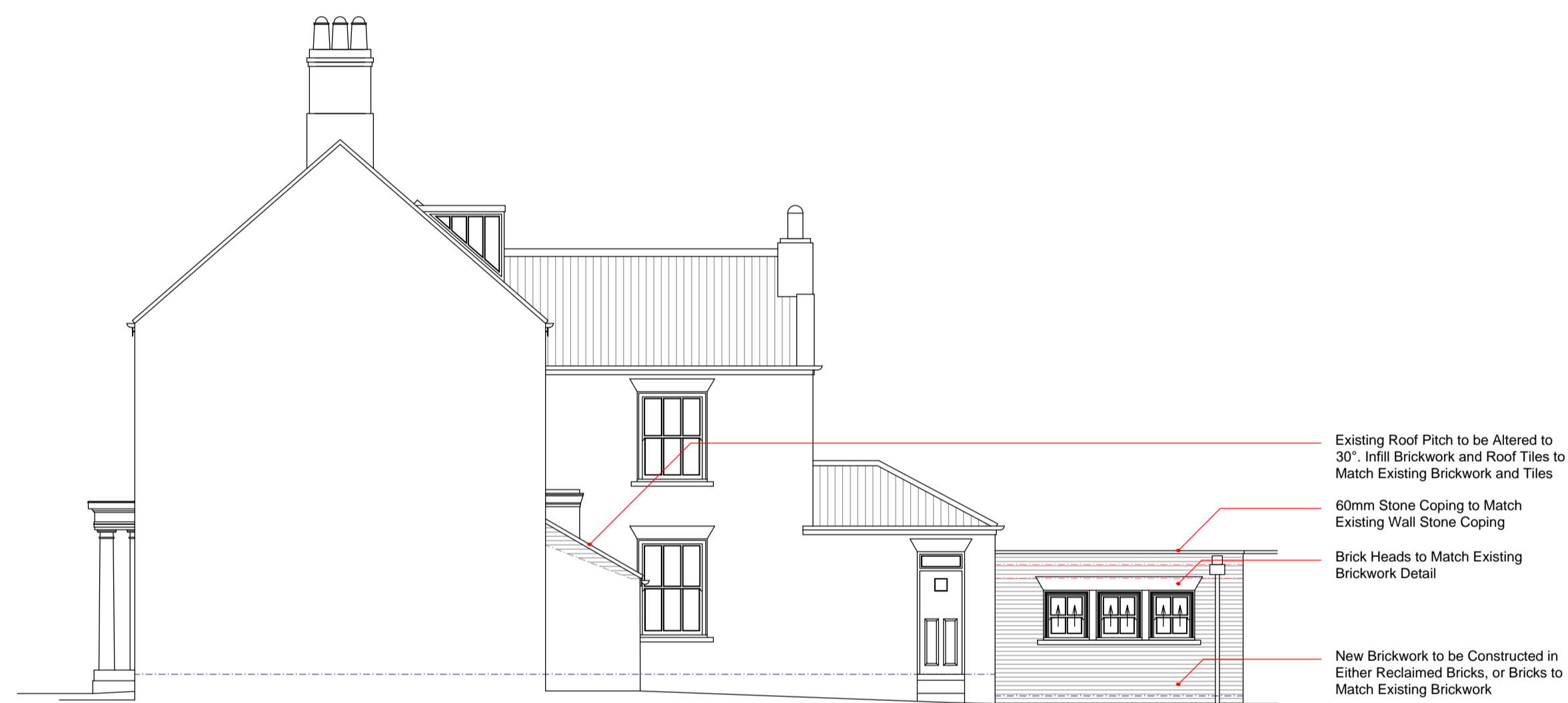
Proposed Outer Side Elevation 1:100