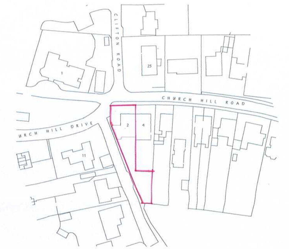
-7. site os (1) 1:1250